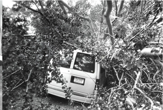
Dottie's car was not spared