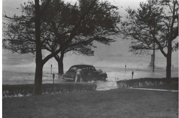
Hurricane Donna (1960)