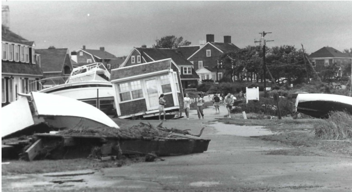
The Penzance guard shack on Bar Neck Road

And blow, it did, as anyone who was in the area in August 1991 will remember.