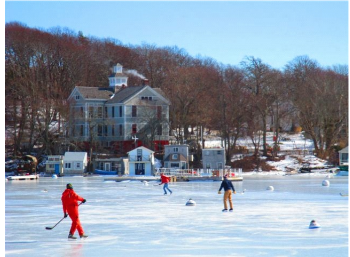
Ice hockey on Eel Pond.

The exhibits that will follow Tom's also feature ice and snow. The Upper Cape Cod Camera Club will display pictures of Woods Hole during this year's harsh, but beautiful winter season. Paired with these still photographs will be two other records of the winter. The first is a video taken from Brian Switzer's drone from above our frozen village, catching people walking and skiing on Buzzards Bay off Stony Beach, and an ice hockey game on Eel Pond. Also, Catherine Bumpus will be sharing her time-lapse photographs of the ice in Woods Hole Passage as it shifted with the currents in the Hole.