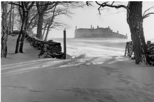
Mansion House in the snow

Betty and her husband were very interested in maritime and scenic beauty. They traveled to Nova Scotia, Maine and the Chesapeake Bay area. During their tenure on Naushon, Betty photographed many island scenes: Hadley Harbor in all seasons, including beautiful winter images, nature scenes around the island, the Naushon horses, the blacksmith and numerous views of Naushon sheep. During Bill's time as Boatman, the delivery of the ferry Cormorant resulted in many photos.