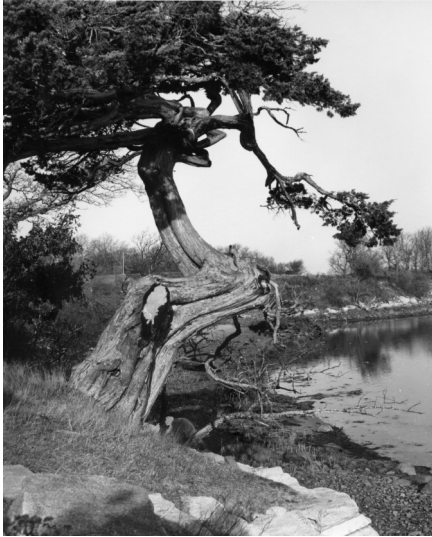
Naushon cedar tree