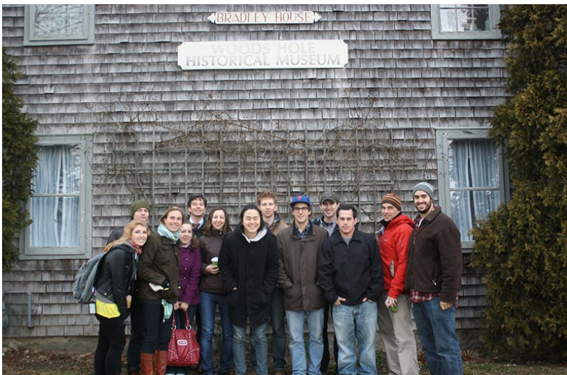
RISD Architectural students visit the Museum, March 11th, 2010.

At the end of the semester, they will come back to Woods Hole to present their final projects to us. Hopefully in the near future, we will be able to choose what we consider the best of their ideas and move the project along from there.