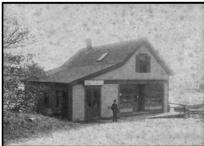
The Woods Hole Social Library moved to a former store on Little Harbor from 1898 to 1910.