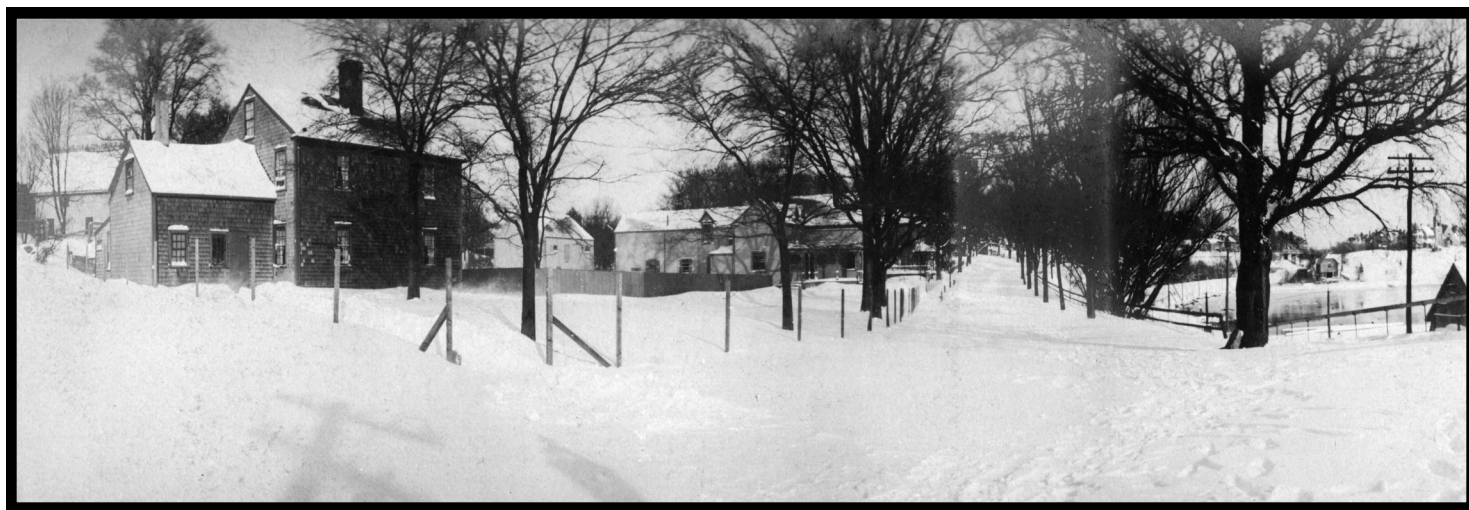
Bradley House and Woods Hole Road, c. 1905.