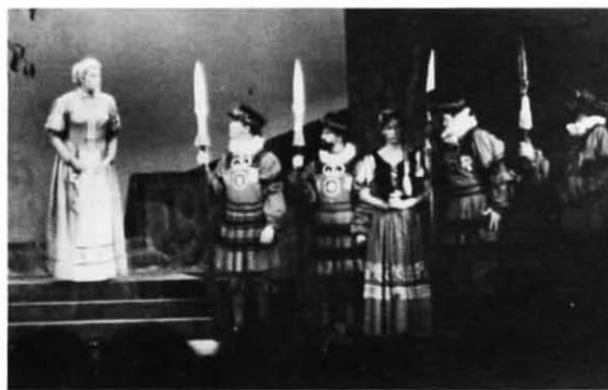
Oberlin Players, 1968. "Yeoman of the Guard." From Theater on Cape Cod.