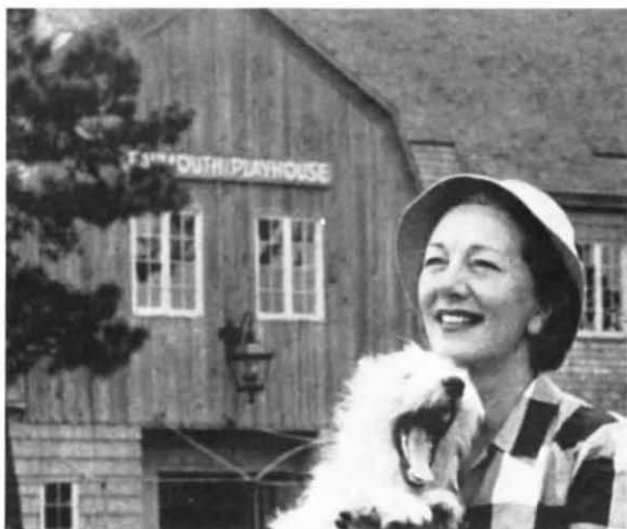
Falmouth Playhouse, 1950. Gertrude Lawrence in front of Falmouth Playhouse. From Gertrude Lawrence as Mrs A.