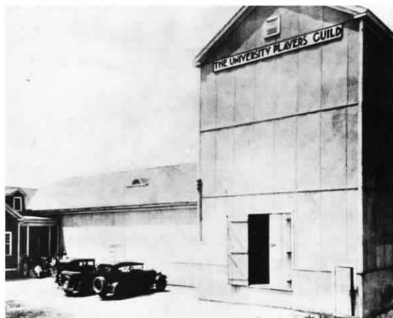
University Players theater at Old Silver Beach, 1931. From But Not Forgotten.

In the late spring of 1932, the directors of the Guild voted to change its name to "The Theater Unit, Inc." partly because they no longer insisted on the members