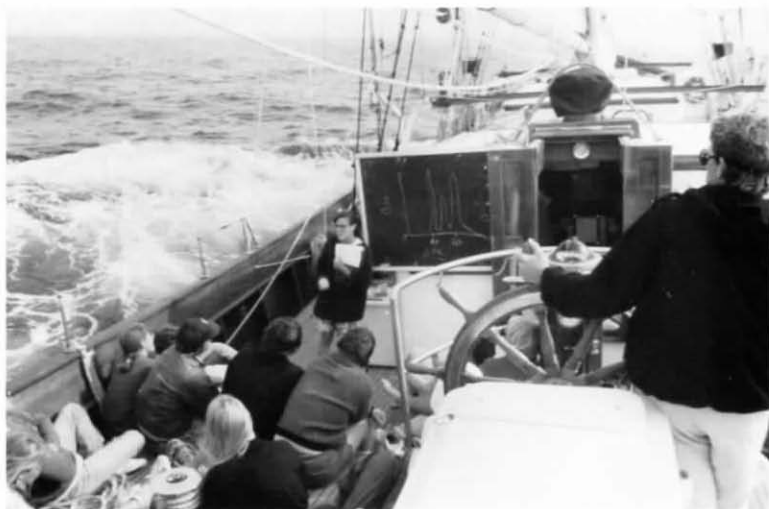
A student explains her research to her shipmates. On board Corwith Cramer, 1989.

Slowly, Sea Semester's reputation grew, as did the list of colleges and universities that awarded credit to their students who participated. Through the efforts of the staff scientists, progress in SEA's science inched along. Among their successes were the compilation and periodic publication of scientific data collected on