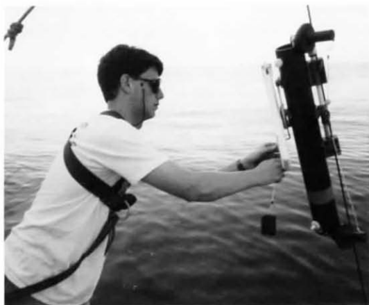
In the late 1980s, Niskin bottles finally replaced Nansen bottles on SEA's ships. Here, a student on Corwith Cramer deploys a Niskin bottle to collect water samples at sea.