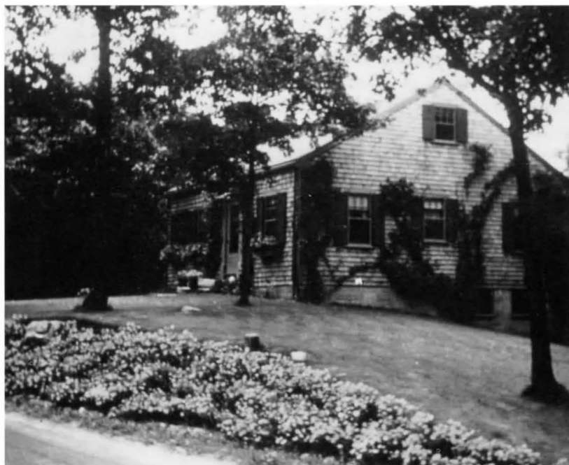
Gabe Bettencourt's house from the road, 1953.

Indian burial ground. All of these plants were native to the area, but the woodlands were as tended as the most formal of gardens. Tree pruners were brought in every year and a crew would work up to two months, clearing, shaping and perfecting the natural wonders.