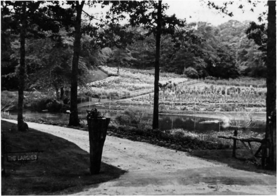
View of the driveway to the road, behind Gabe's house showing daylily bed, pond, and ribbon garden on the left, 1992.

A house was built for Gabe at the northeast corner of the property along the road. The front yard was high above the street and the bank was planted with pink wax begonias for about forty feet. Behind the house the hill that ran down to the driveway was terraced and each level was filled with pink petunias. A set of stone steps ran along the northerly edge of the terrace and a pair of large Oriental brass cranes stood at the bottom on the drive. A small strip of lawn was placed next to the terrace on the southern side and all of the rest of this yard was planted with pink petunias. It was not a bed in the normal sense of the word, but more of a ground cover of pink. Hanging from trees and at focal points along the drive were long cypress knees containing tuberous begonias and annuals of all kinds.