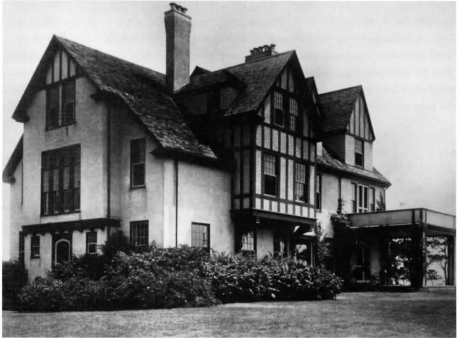
The Big House at The Larches, Woods Hole, Massachusetts, seen from the northwest, ca. 1955.

europaea ), European white birch ( Betula pendula ), black walnut ( Juglans nigra ), Catalpa, American white elm ( Ulmus americana ), horse-chestnut ( Aesculus hippocastanum ), Kentucky coffee-bean ( Gymnocladus dioica ), black locust ( Robinia pseudo-acacia ), Norway maple ( Acer platanoides ), Sycamore maple ( Acer pseudo-platanus ), white willow ( Salix alba ), red pine ( Pinus resinosa ), Scotch pine ( Pinus sylvestris ), Norway spruce ( Picea abies ), white spruce ( Picea glauca ), blue spruce ( Picea pungens ), and European mountain-ash ( Sorbus aucuparia ) and European larch ( Larix decidua ). In consequence, Woods Hole is a seaside marvel of horticultural diversity and lushness.