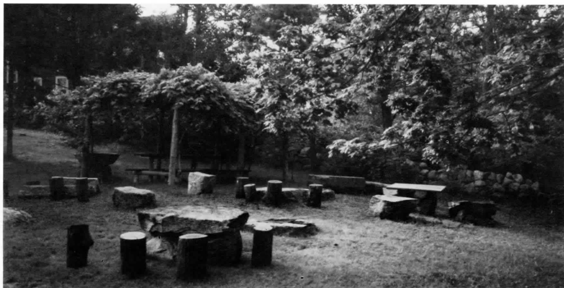
The Grove, 1992.

the water and in the fall their bright red color was reflected in the water below.