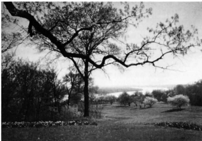
The orchard, Bee Tree Farm, 1969.

Despite this aura of elegance, the most distinct impression she gave was a woman of nature. More than one person has described her as a dirt farmer, but this is not entirely accurate. She had a love of nature that went beyond the ordinary gardener. Her ethereal spirit was one with nature. Although she loved her family and friends, she never quite related to nor understood people as well as she did the natural world. Her eyes