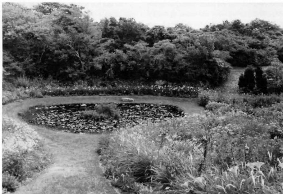
The Black Lacquer Garden looking down the northern slope, 1991.

On the opposite hill at the northern top of the Black Lacquer Garden but hidden from view by a thick row of trees was the garage. Behind this, two low swampy spots were also turned into ponds. Being surrounded by thick bushes and trees this area was more somber and in sharp contrast to the exuberance of the flower beds. The larger pond was dug more deeply and surrounded by rocks. A path of stone steps led down from the driveway above and curved to a stone path that led directly to the pond's edge. A wide terrace was cut into the bank and covered with an enormous planting of wax begonias. Wild roses and ferns covered the steep drop down to the pond itself. A large rock was left in the pond as a focal point, with irises behind it. Ferns and moss wove through rocks leading up the opposite hill to a magnificent beech tree. The pond was surrounded by huge tupelos ( Nyssa sylvatica ), some of whose branches swooped out over