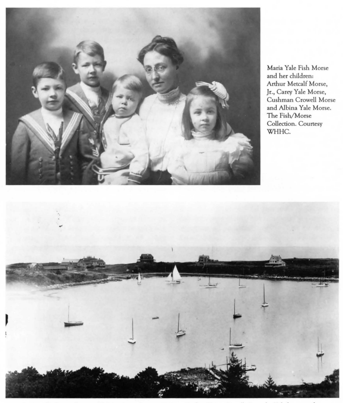
Quissett Harbor at the turn of the century, showing Quissett Harbor House, Petrel's Rest, the Yale house and Harbor Head Cottage.