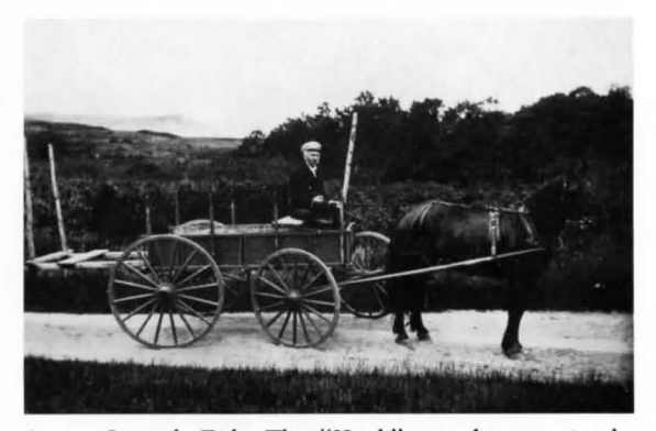
Aaron Cornish Fish. The "Knob" may be seen in the background.