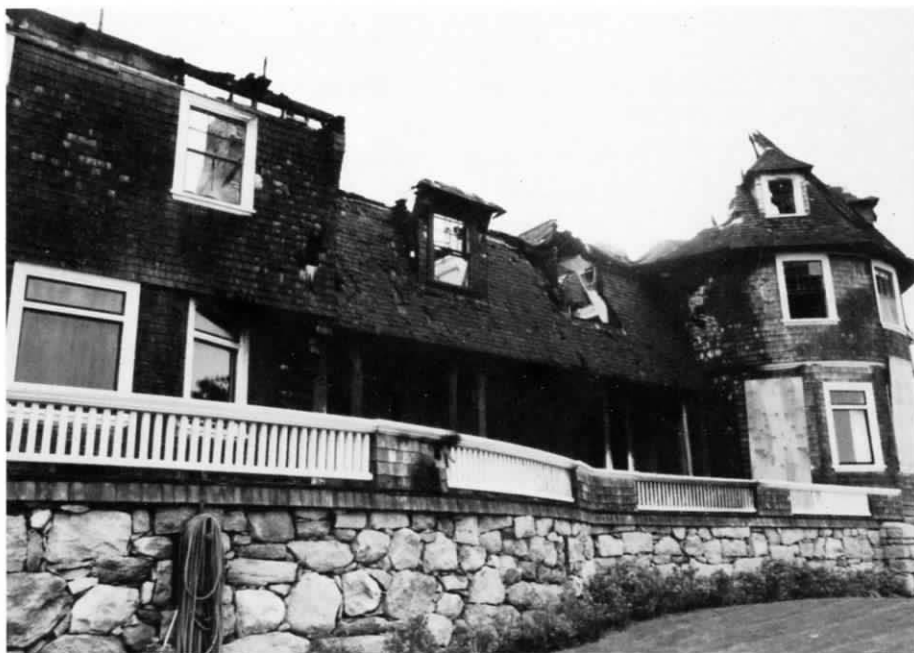
Wheelwright House after the fire.