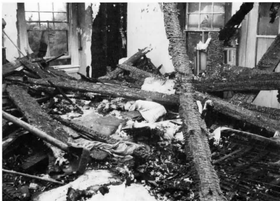
All photos of reconstruction by Houghton Quarty Warr, Architects.