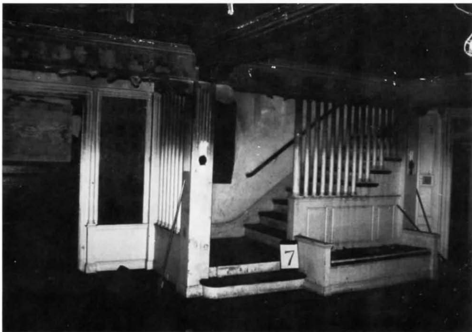
Front hall and stairs showing burned floors, walls, ceiling, decorative woodwork, sconces and leaded glass.