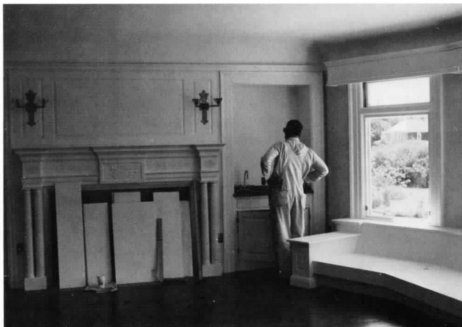
Restoration of living room nearing completion.