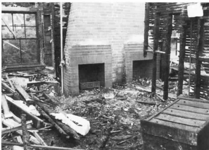
Rubble that had to be sifted by hand in search for hardware.