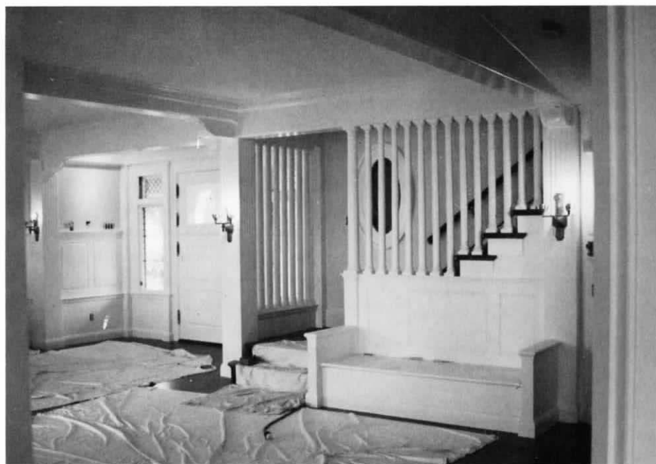
Front hall and stairs after restoration of floors, walls, ceiling, decorative woodwork, sconces, and leaded glass.