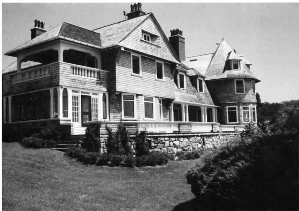
Reconstruction of Wheelwright House complete, summer 1988.