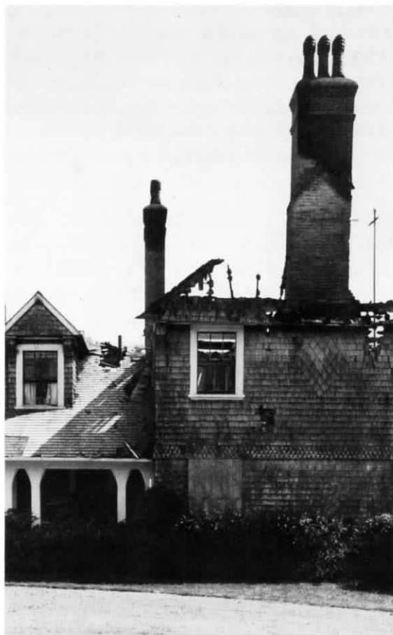
Chimneys and chimney pots after the fire.

building continued to smolder until the following morning by which time only a fraction of the northeast exterior wall was unscarred. The rest was either charred or had collapsed inwardly so that surviving joists on the second floor supported five feet of water-soaked plaster and rubble, some of which dropped through to the first floor. Only the kitchen was unharmed by the fire, but since it was open to the elements, summer rains eventually destroyed even that portion of the house. By the time drawings for reconstruction were completed, the house, with the exception of the basement, was largely lost.