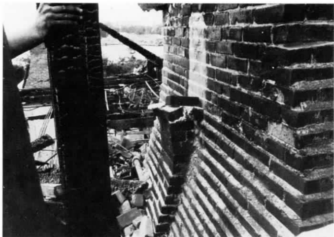
Work involved in removing chimneys before reconstruction could begin.