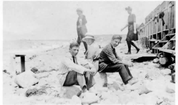
Quissett Harbor House bath houses and bathing beach on Buzzards Bay, ca 1915.