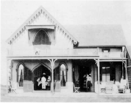
The Cottage, at the end of the alley, where the DeWitt family lived for many summers. 1914.

moved the Hammond House down the hill and attached it to the Jenkins House by means of a connector, which finally served as the main part of the hotel, containing the dining room, living room, and many bedrooms. This was in 1874.