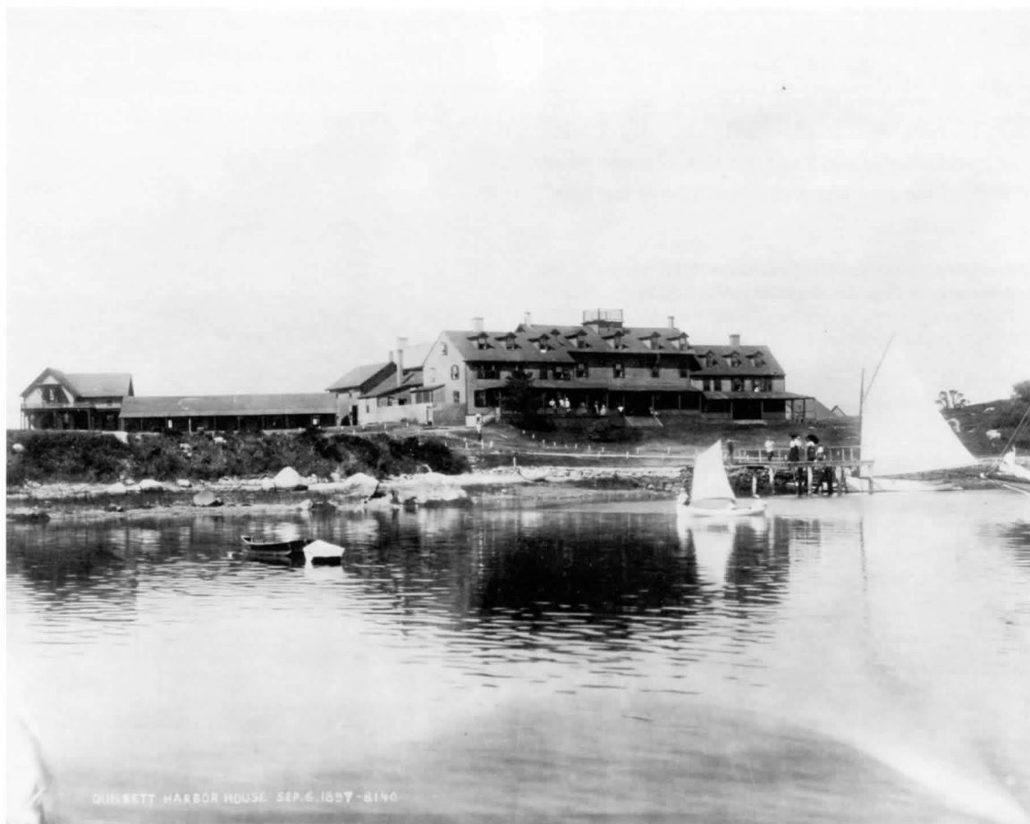
Quisset Harbor House, September 1897. From left to right: the Cottage, old saltworks called "the alley," the Jenkins house, the connector (with dining room behind), the Hammond house.