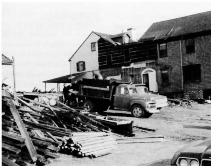
End of an era. Remains of the connector on ground, Jenkins house behind truck, Willett Hall (old dining room) on right, 1977.