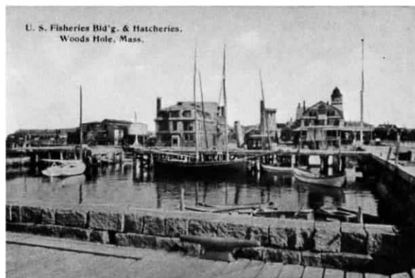
U. S. Fish Commission buildings, docks and small boat basin.