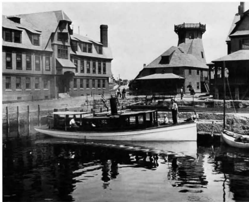
MBL motor launch Sagitta at Fisheries landing.