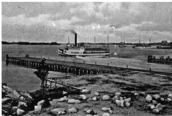
Steamer Gay Head leaving Woods Hole.