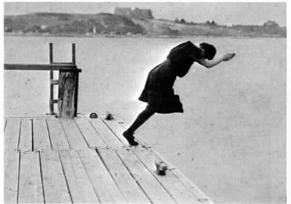
Diving off the float at The Anchorage.