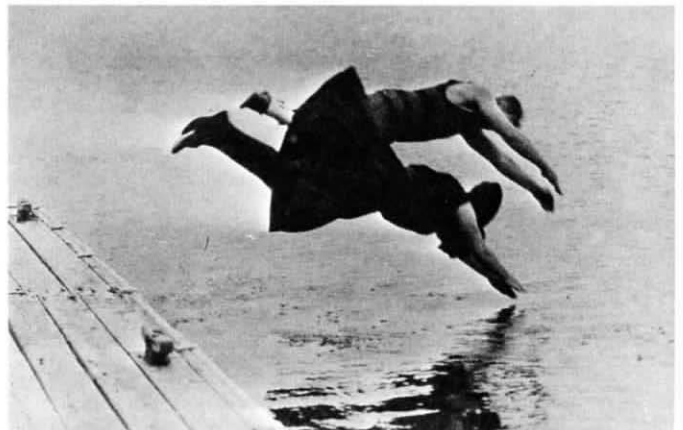
Summertime on Penzance Point. Diving off the float at The Anchorage. Warbasse photo album. Courtesy WHHC.