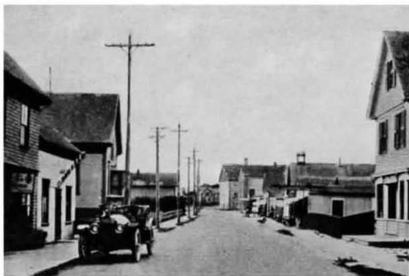
Main Street (now Water Street), looking west, ca. 1912. Community Hall on left beyond barbershop, Candle House in distance on right. Postcard collection, WHHC.

We next came to the Causeway, as we called it, the narrow strip of land between Buzzards Bay on the North and a little pond on the south. The pond connected with the harbor by a creek that wound through a boggy area teeming with fiddler crabs. We used to catch them by the pail-full to use for bait. At the next bend in the road were the homes of Ben and Will Strong. Up ahead was the Hibbard house on the Bay side of what at that time was a dirt road. The Penzance road was not paved until a few years later when the telephone and power lines were put underground and the old poles taken down. The Hibbard boat house was