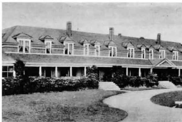
Breakwater Hotel, facing Great Harbor, at the entrance to Penzance Point.