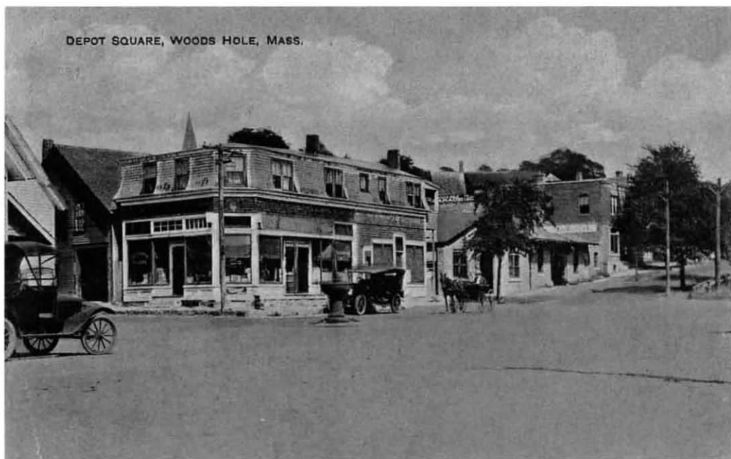
Eaton's Lunch on Depot Square, later James' Grill, then the Leaside. Building torn down in 1989 to make way for the new Leaside.