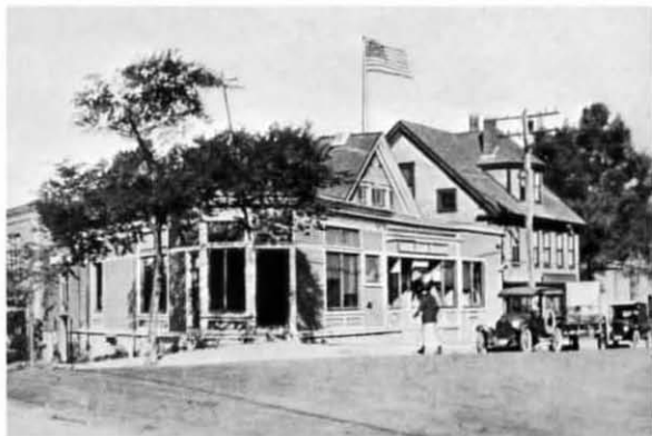
Woods Hole Post Office, now the Woods Hole branch of the Falmouth National Bank.