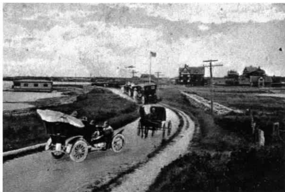
Traffic on Penzance Point beyond the Breakwater Hotel, ca. 1912.