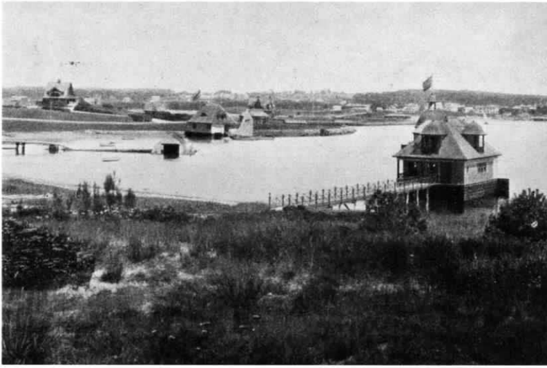
Hibbard boat house, "the fanciest one on the Point," with Woods Hole village in background.