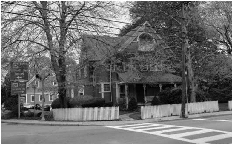
Watson's Corner.

Watson's Corner is one of the busiest intersections in Falmouth. It is the three-way junction of North Main Street, Locust Street, and West Main Street. One road leads north as North Main Street-Palmer Avenue, one leads east to the Falmouth Village Green, and the third road, Locust Street, leads south to Woods Hole. Who were the Watsons? And why is this corner named "Watson's Corner"?