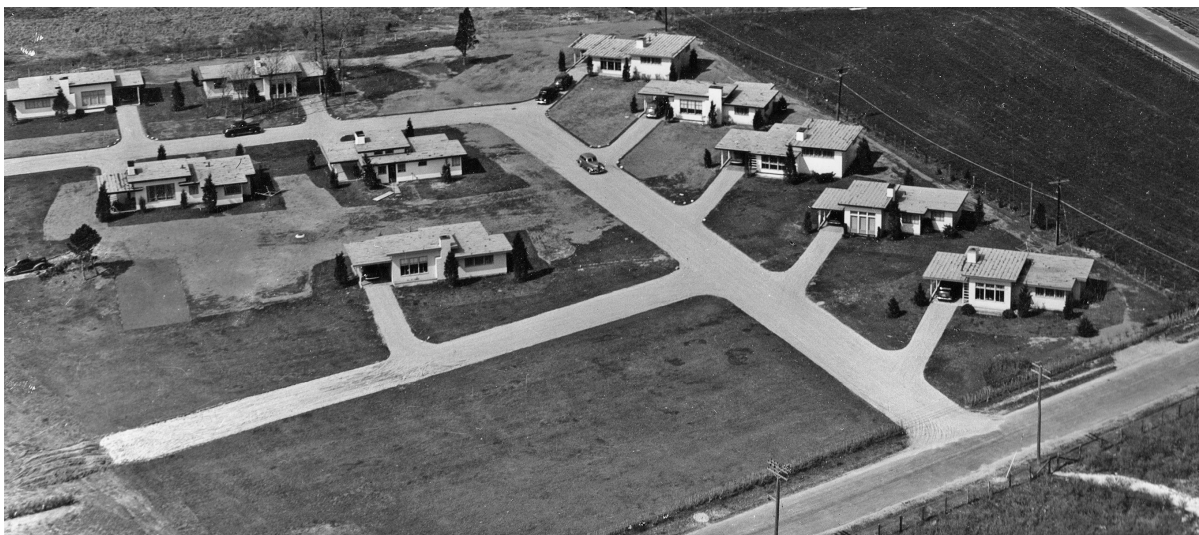
Bywater Court, circa 1960. Surf Drive is in the lower right.