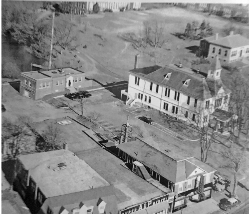
The police station, Town Hall and library with the Village School in the background and the A & P on Main Street in the foreground.

He explained that his father's few years at the Kellogg architecture firm were similar to an apprenticeship and the only time he worked for anyone. "He was eager to be on his own."