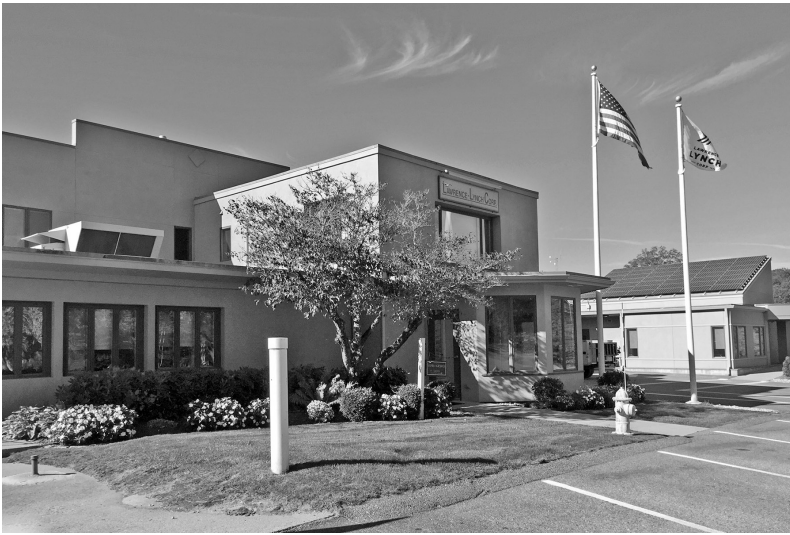
The Lawrence-Lynch Company building on Gifford Street.