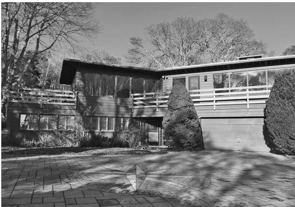
The home on Oyster Pond Road built by Gunnar Peterson for his family, as it is today.

"It is safe to assume that only 10 percent of the homes on Cape Cod are in the style commonly known as Cape Cod type. ... this style only had significance when it was conceived, and incidentally the colonial house met the needs of its builder, admirably. Then it was real - today it is stage dressing, sham, imitation not creation.