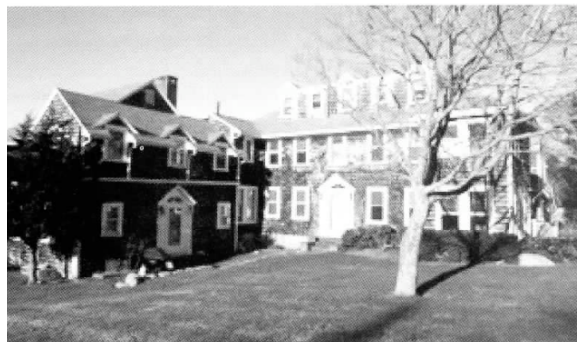
Sandalwood.