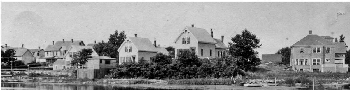
The DoReMi houses as seen from the Millfield Street side of Eel Pond.