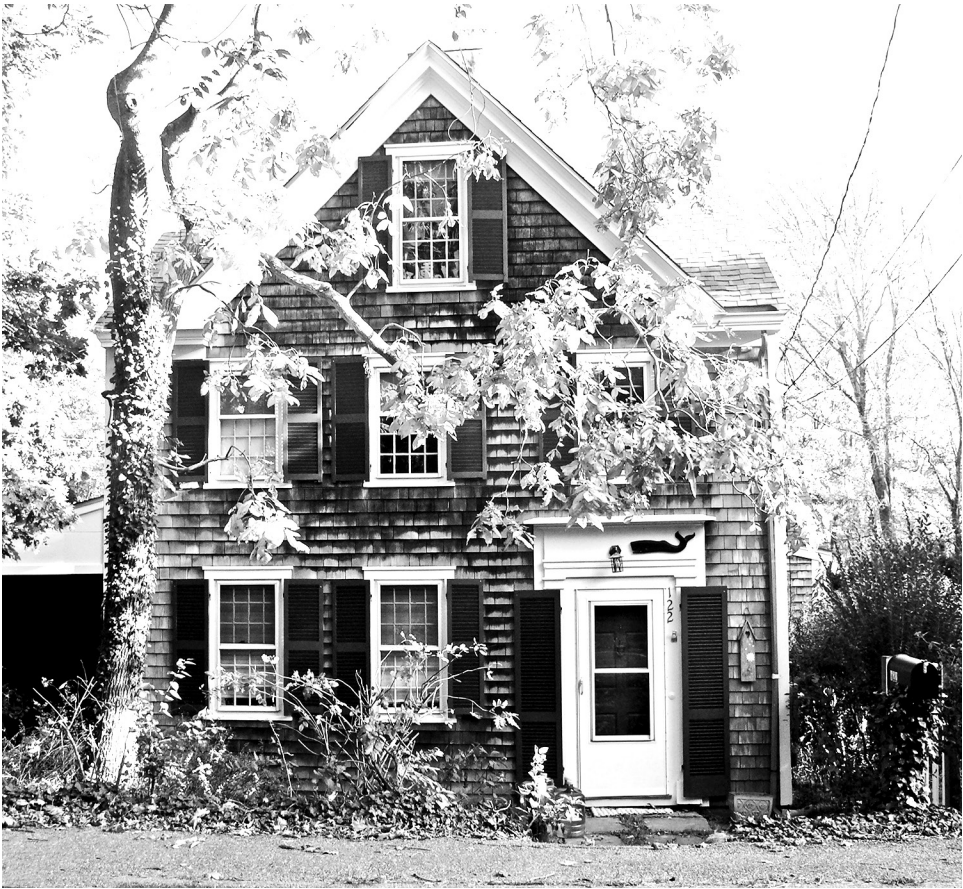
Moses Hatch house.