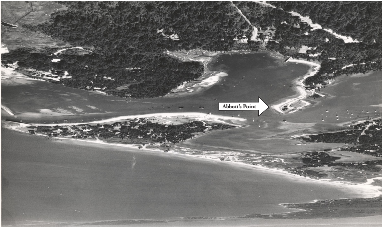
West Falmouth harbor from the air.

When the announcement came that the Cape train was made up, we walked to the gate with our suitcases, the cat basket, and usually a couple of dolls and the red tin doll's trunk.