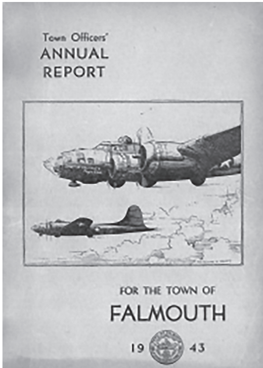
Annual Report cover.