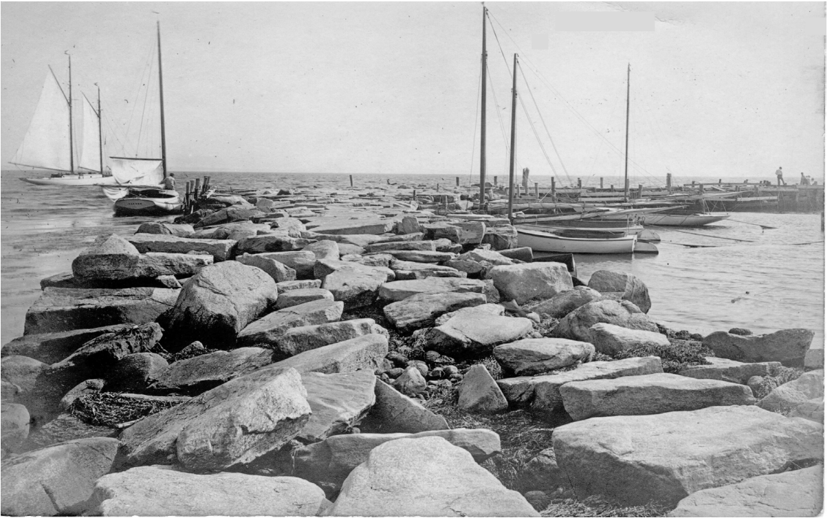
Old Stone dock.

its citizens for business and pleasure. Located at the corner of Shore Street and Surf Drive, often referred to as the shore road or the beach road on old maps, the dock and the aptly named old stone dock neighborhood became the economic hub of Falmouth, servicing the mariners, fishermen, traders, and travelers utilizing the dock.