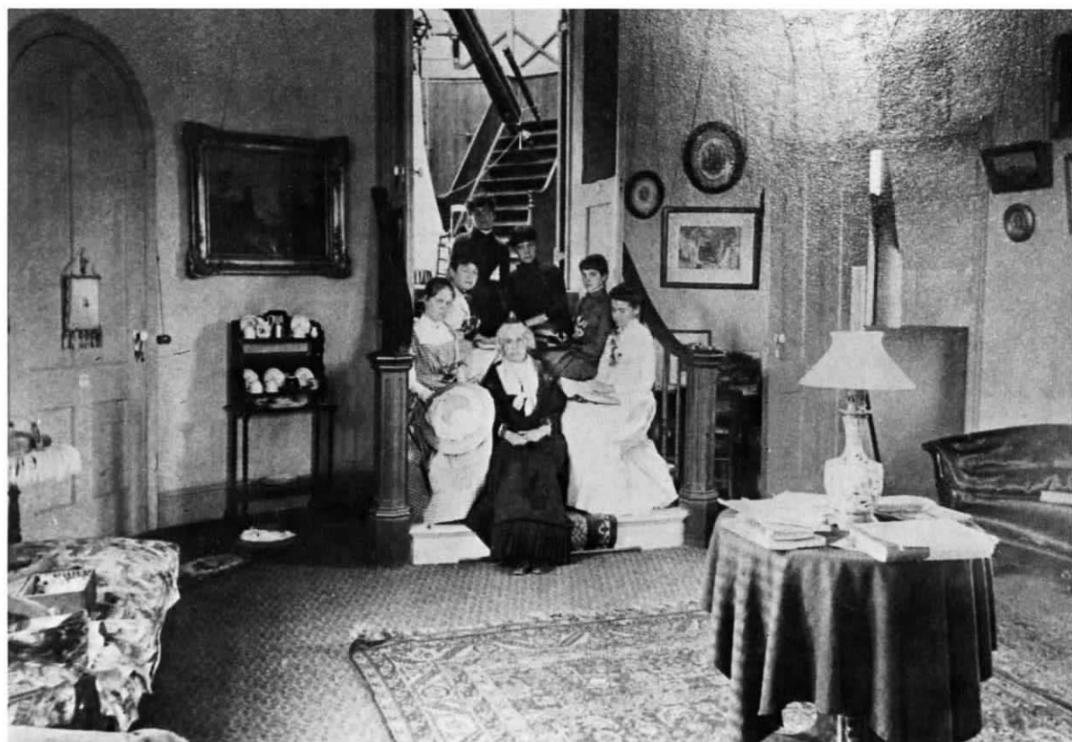
With class in Vassar College Observatory, 1885.