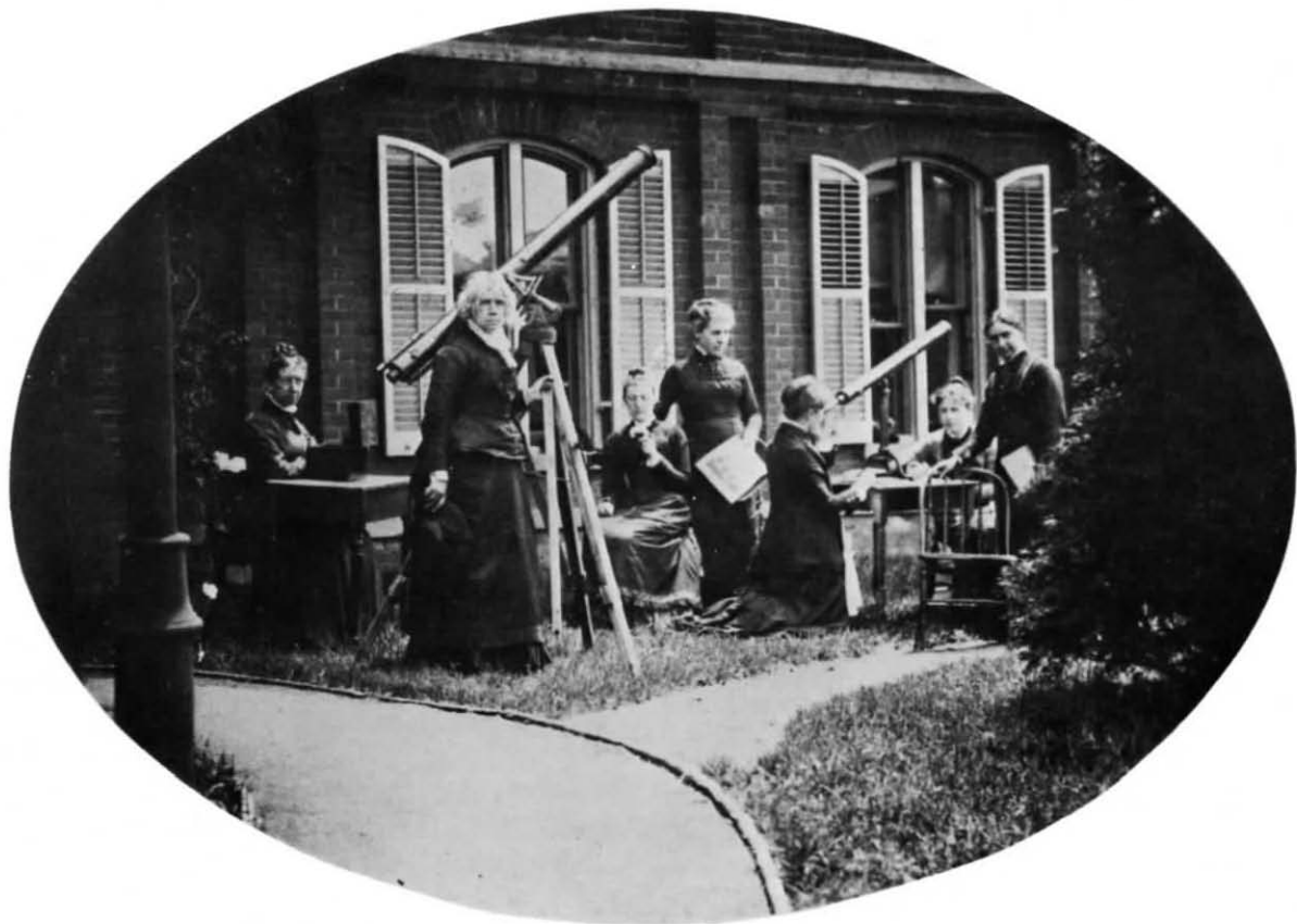
Astronomy Class with Maria Mitchell in front of Observatory at Vassar, 1878. Student kneeling is Elizabeth Cady Stanton's daughter, Harriet Stanton Blatch, Vassar, 1878.