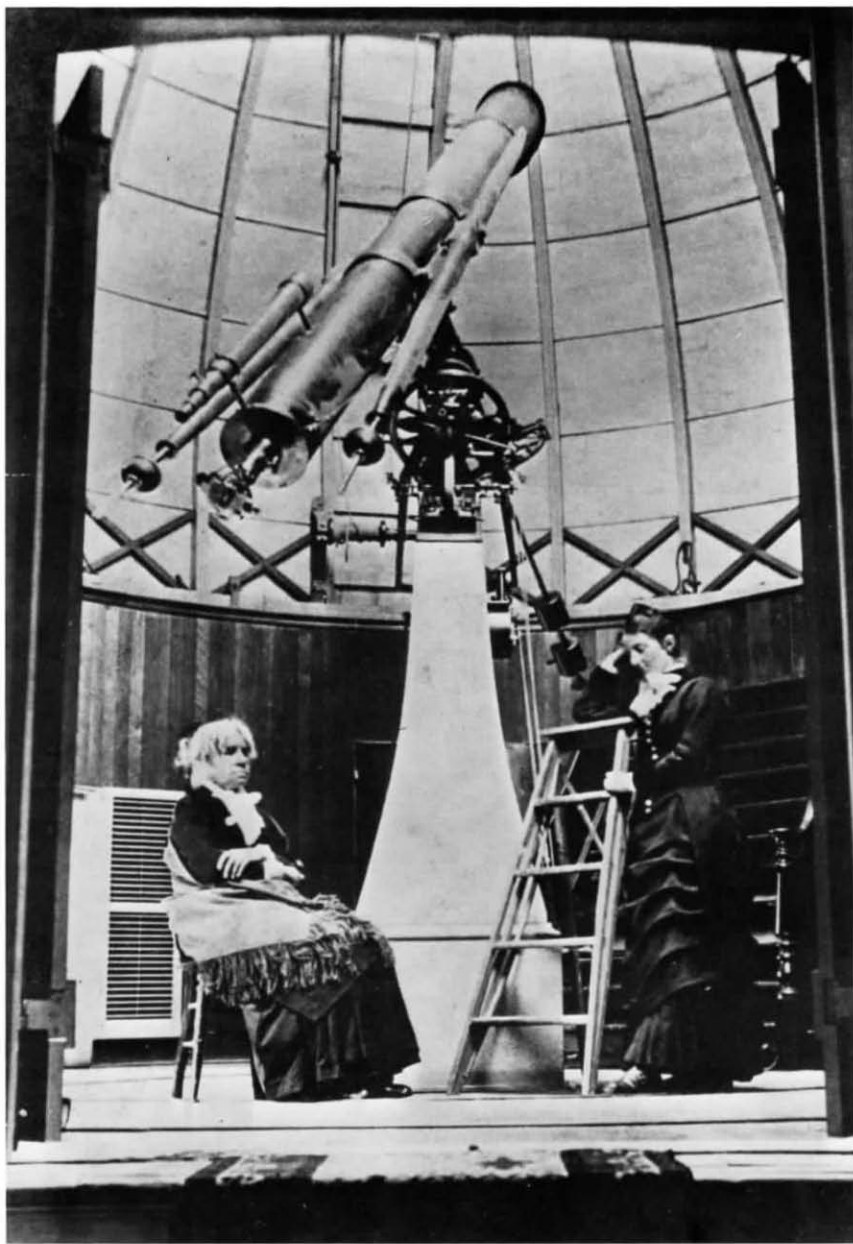
Waiting for the skies to clear, circa 1877.