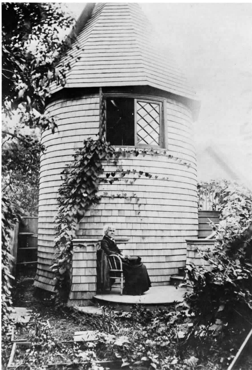
Waiting for sundown. Note open door in revolving roof and telescope visible through upper window. On Christmas Day 1888 Maria Mitchell retired to Lynn, Mass. There she continued to sweep the skies in the little observatory of which she proudly said, "Lick Observatory is the largest in the world; mine is the smallest."