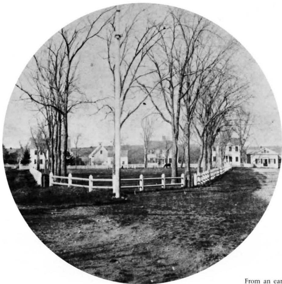
From an early stereoscopic slide of the Village Green, ca. 1857, after the First Congregational Church was moved and before the roads were paved. Elija Swift planted the trees and built the fence around the Green at his own expense in 1832-33.