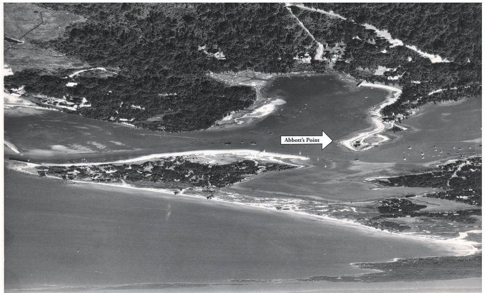
West Falmouth harbor from the air.

Long before my time there was another 'almost visitor', a stout gentleman who was seen fishing with a companion off the end of the point. A discreet check with the spy glass verified that it was President Grover Cleveland, who summered at Gray Gables.