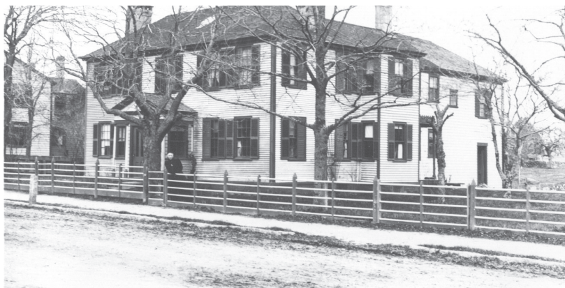
The old Shiverick house on Main Street.