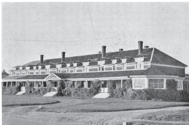
The Breakwater Hotel on what is now Bar Neck Road. The site has become an unpaved MBL parking lot.

In the 1960s, talk began of a new MBL building to provide dining facilities, meeting rooms, and dorm space. This would not only replace the old wooden mess hall at the corner of Water and Albatross streets but would provide other needed space for conferences. The corporation acquired the Breakwater Hotel, the old wooden "rocking chair" type summer hotel on Bar Neck Road, as a possible location for a new building.