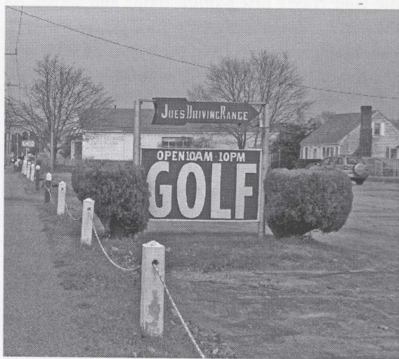
The last Driving Range sign, 2011.