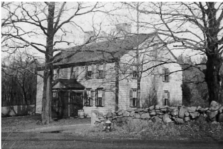
The old Eldred Homestead.