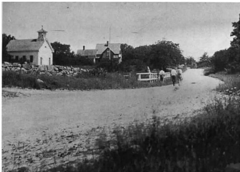
The Quisset schoolhouse.

box with a glass front – about 6" x 8" – and the key to the school house was in it. When there was a fire, anybody that wanted to gave an alarm – broke the glass, took the key out, opened the school house and rang the bell. The hose house was next to Quisset Hall [still standing]. The hose wagon was just two wheels with the hose wound on a spool and it was pulled by the men. They did not need to use a horse as they did not have to go far; it was just for Quisset!