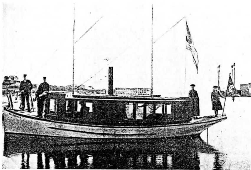
Christian Endeavor mission launch, Vineyard Sound, Massachusetts.

As indicated by the adjacent picture, our local branch of Floating Christian Endeavor was active in Vine-