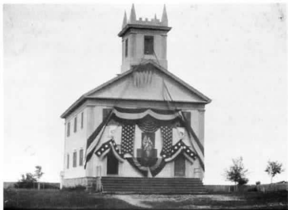
The Village Grammar School, now the Odd Fellows Hall, was built in 1856. Katharine Lee Bates attended the school until she was almost 12 years old when her family moved to Wellesley Hills, MA. Most of her early poems and stories were written while she was a student at the school. This photo shows the Odd Fellows Hall decked in bunting for the Town's bicentennial celebration in 1886.