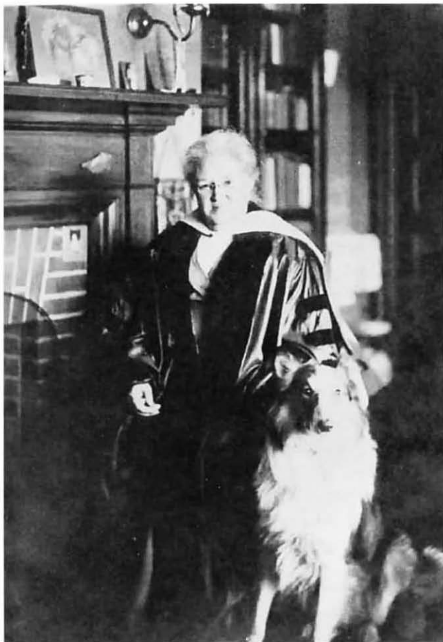
Professor Katharine Lee Bates with her dog, Hamlet.

Throughout her 69 years, Katharine Lee Bates wrote 11 volumes of prose, 12 volumes of poetry, and 31 diverse works as an editor and translator. She retired