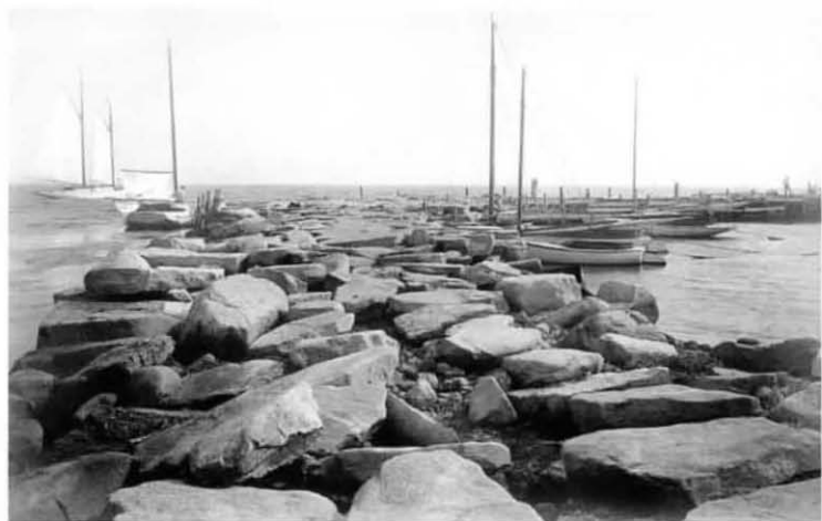
The Old Stone Dock at the end of Shore Street, constructed in 1801, was the commercial port of Falmouth. Packet ships and schooners brought needed provisions to the town from larger cities such as New Bedford and New York.