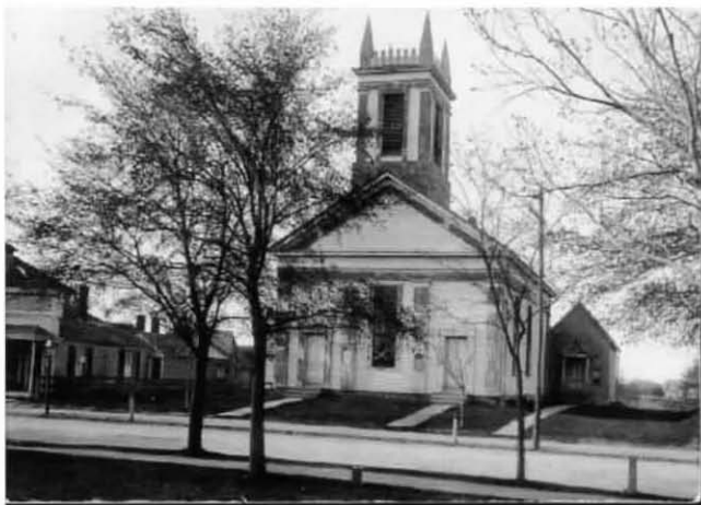
In Katharine Lee Bates' early years the Methodist Church (1848-1957) was one of only two churches in Falmouth Village. There were two entrances at the front of this imposing structure, one for men and one for women.