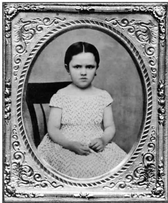
Young Katharine Lee Bates in Falmouth.