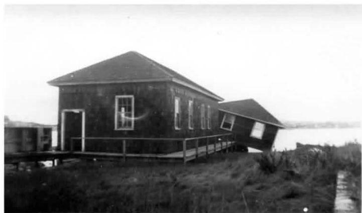
Park boat house (now gone) against Strong's boat house, 1938.