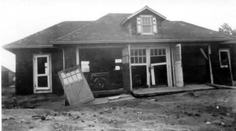
Park garage (now Swope). Car turned around by storm.

Hole forms the southern boundary of these places. The neck and salt marsh lie to the south of our houses, which are about a mile out on the Point and