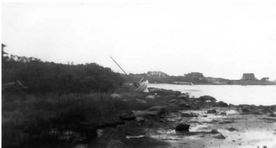
Warbasse's sloop on dry land. September 1938.

During the morning of Wednesday, September 21st, there was a warm southeast wind. As it increased someone wondered whether it could be in any way connected with a hurricane reported down Florida way, but was told it was only an ordinary Southeaster.