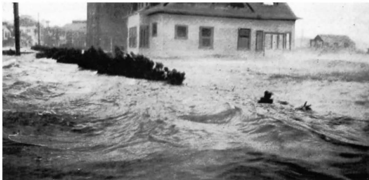
Marine Biological Club House. 1938 Hurricane Pictures published by Reynolds Printing, New Bedford, MA.