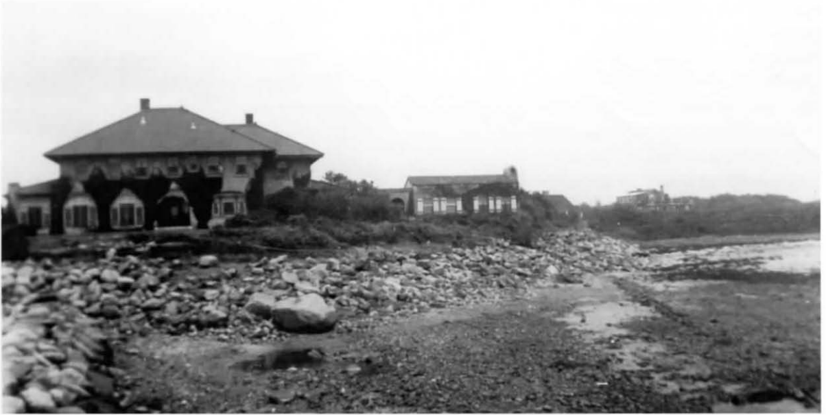
Park family house; sea wall damaged.

water main bridging a gap and about to give way. Parts of the village are still without electricity.