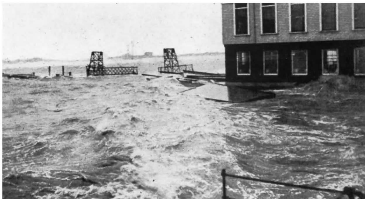
Bureau of Fisheries. 1938 Hurricane Pictures published by Reynolds Printing, New Bedford, MA.