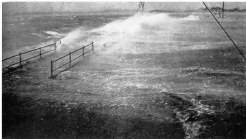
Bureau of Fisheries wharf. 1938 Hurricane Pictures published by Reynolds Printing, New Bedford, MA.