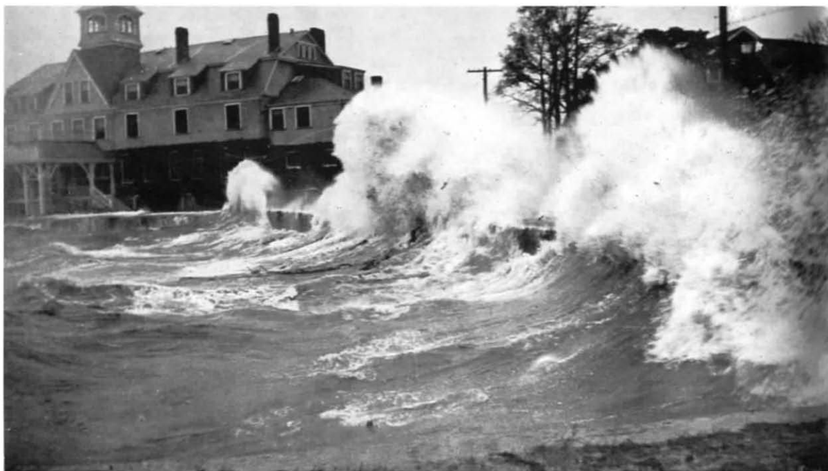
U. S. Fishery Building during the hurricane. 1938 Hurricane Pictures published by Reynolds Printing, New Bedford, MA.