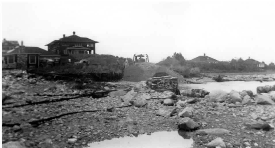
This was the Causeway from Strong's to Park's.