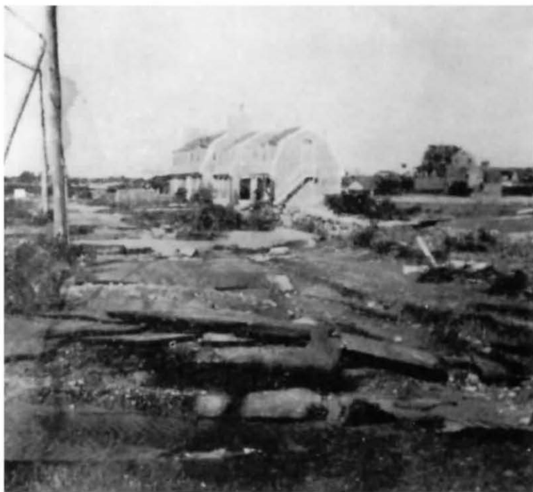
Road destruction where hurricane waters swept across narrow causeway between Woods Hole's Great Harbor and Buzzards Bay. Murray Crane house at beginning of Penzance Point in the background. From Hurricane, the Complete Historical Record of New England's Stricken Area, September 21, 1938.

The worst break was where Briggs lost his life. The whole low-lying ground was cut out and deposited in the marsh, including the masonry wall constructed by Park as protection against the sea. Fortunately we have in Woods Hole Messrs. Sidney Lawrence and Son, road builders, etc. with a good organization. They repaired the road at the neck in about twenty-four hours, of course, only dirt, and in another forty-eight hours had a dirt road across the gap between us and the Park place. The high tide nearly got them though before they had the dirt sides covered with stone riprap. Even more will have to be done to make it permanent. Luckily my brother Will was still here and played a leading part in getting things under way. Mr. Jewett also helped materially and the town said they would have the dirt part done by them because