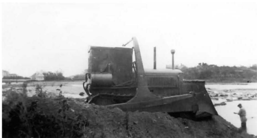
Bulldozing for new road, 1938.

or the boat also deposited by the tower. She asked a man to go with her in to the Tower garden and asked them what they were doing. They said "Looking around." As it was 9:30 at night and pitch dark and they were smoking she asked them to go out as the people did not want any fire risk and told them they had better clear out, which they did. She reported their truck license number to