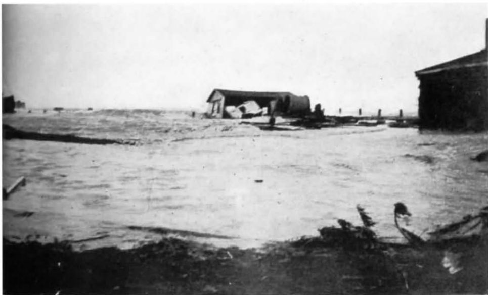
Penzance Garage Wharf, Sept. 21, 1938. 1938 Hurricane Pictures published by Reynolds Printing, New Bedford, MA.