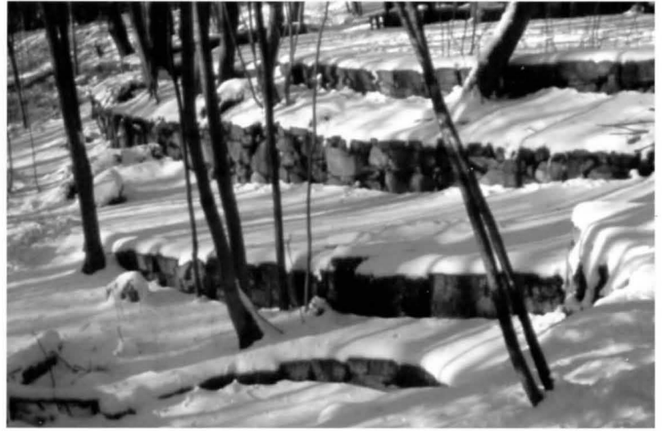
Snow-covered stone retaining walls.

“Donald Durell & Associates, landscape architects, have been employed for months in the development of a plan that will create a distinctive village within Falmouth, a community of substantial houses with wide expanses of common parkland. The Durell plan envisions a shopping center and eventually a school.