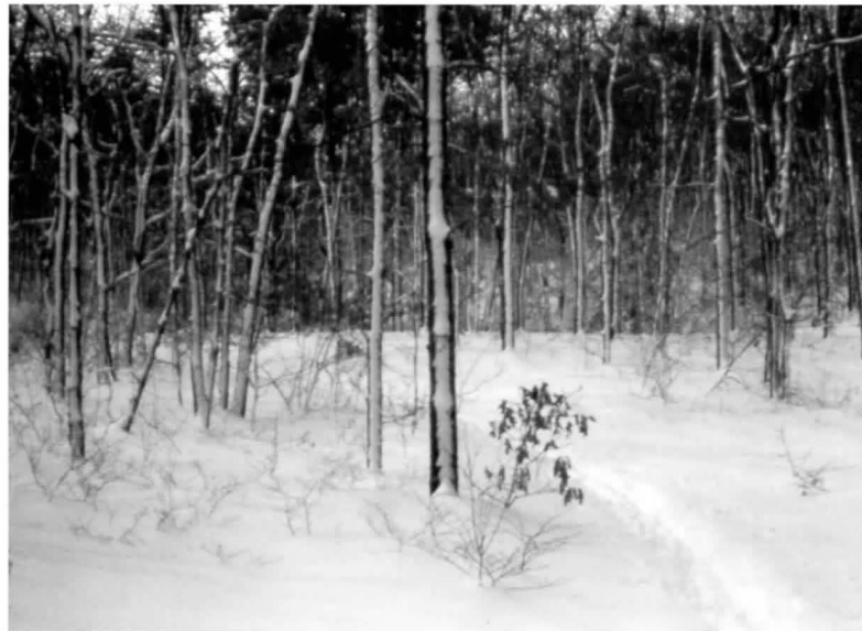
When snow is deep enough to cover glacial till in the woods, both narrow and wide paths are ideal for cross-country skiing.

The new road would have had two paved strips, each 24 feet wide, separated by a 20-foot grass median.