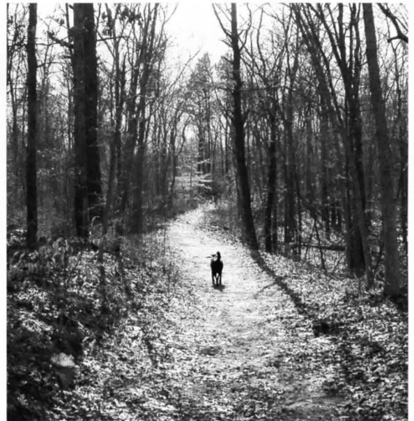
Dog heads home through Beebe Woods after visiting adjacent Peterson Farm.