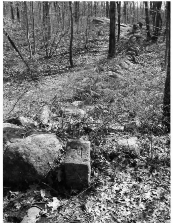
Stone wall and granite marker #71 by path to Two Ponds.

They built and rebuilt miles of stonewalls, many that long ago had formed pastures for the sheep and cattle that roamed the hillsides. They surveyed their vast holdings, and at various and numerous points placed markers of expensive polished granite that can still be seen throughout the woods. And they built their woods roads so well that today, cleared of windfalls and other obstructions and thoroughly brushed out along their edges, they're as smooth and pleasant to travel over as they were almost a century ago. And all along their ways Frank Beebe [youngest son of