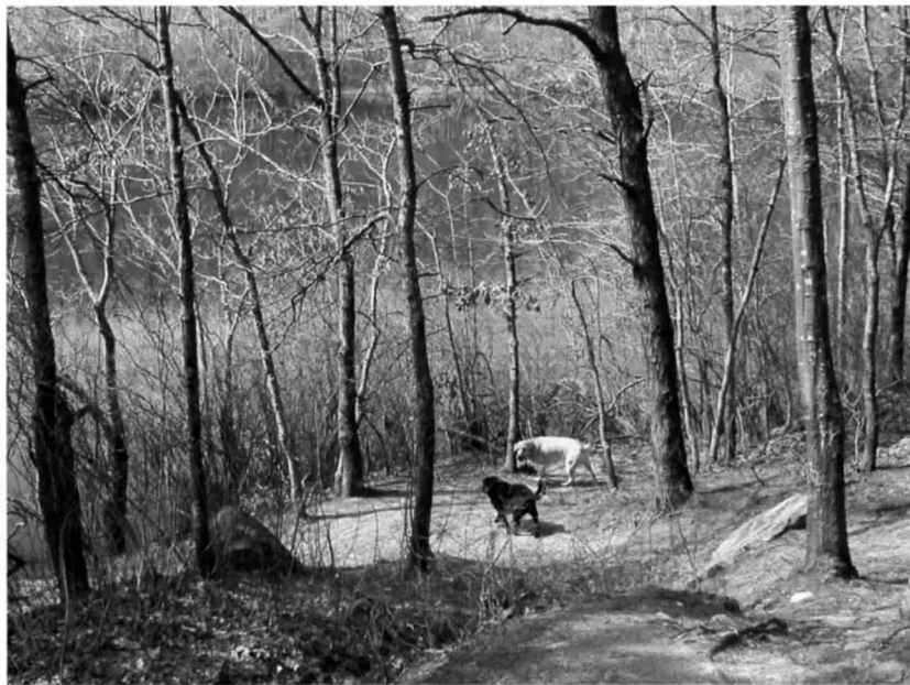
Dogs hurry down the slope to plunge into the Punch Bowl, hoping to retrieve countless thrown sticks.

On such a beach, solidity loses credibility. The Beebe Woods becomes mere mounds of loose gravel (gravel, it is true, that sometimes runs twenty feet coarse, but gravel nonetheless) with a thin coating of cellulose. Its moraine hills are indeed fossils of glacial movement, but fossils whose fate it is to move once more, under the urging of wind and wave, to descend to the beach and become, at last, like the rocks