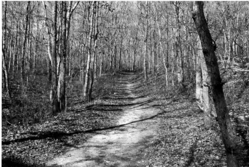
Former carriage path is narrower and more natural today than when it was created and carefully tended.

Throughout Cape Cod, Indian villages, trails and trade routes to inland locations were found by European explorers and settlers of the early seventeenth century. A map of authenticated Indian trade routes shows a network similar to contemporary Route 28 and its subsidiaries, trails used but unmarked and unmapped for centuries. One trail began near Sandwich, proceeding through North and West Falmouth, through the woods [including Beebe Woods] to present Elm Road and on to Nobska Point, from which canoes were launched for travel to the islands. Indian trails also connected over land and rivers with trade routes in areas to become Rhode Island, Connecticut and more distant regions.