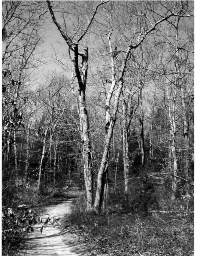
Common trees representative of the Cape comprise most of Beebe Woods.

Swallowed by the forest, I once again felt its hushed richness. The lady's slippers and mayflowers of late spring were replaced with blue and orange woodland asters and the red berries of wintergreen. The earthy colors of mushrooms dotted the forest floor. Oak leaves glowed with a subdued brilliance. Beeches curled their leaves into coppery scrolls, and their smooth trunks sported a variety of blue, green, and gray lichens. Beside the roadbed, bright green mats of hairycap moss and delicate fronds of maidenhair fern greeted the eye.