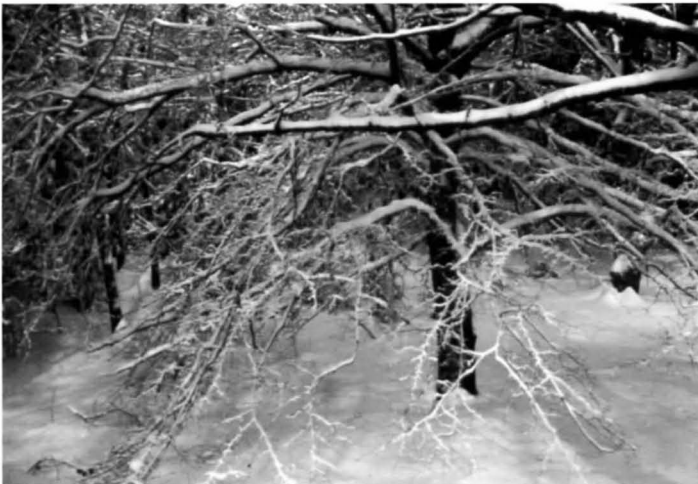
Beebe Woods is beautiful in every season.