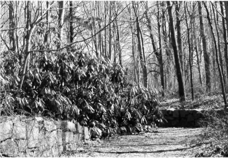
Rhododendrons and handsome stone walls at carriage path approach to Highfield Hall.

James M. Beebe] planted trees and shrubs to enhance the natural beauty of the woods. (Moses, p. 132)