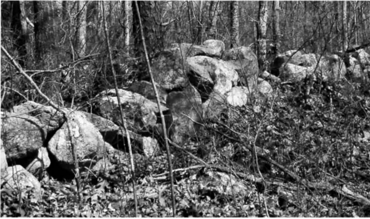
Stone walls overgrown by thick woodlands, brambles, leaves and fallen tree limbs.

out lots along the “neck” lying between the two ponds, now known as the Mill Road area, at the head of which is the Old Town Cemetery.