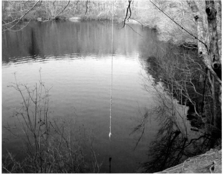
Rope swing offers adventurers dramatic plunge into the Punch Bowl.

I had heard from several sources, however, that the Punch Bowl was truly deep and had, in fact, been