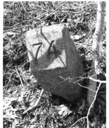
Marker #74 stands alone.