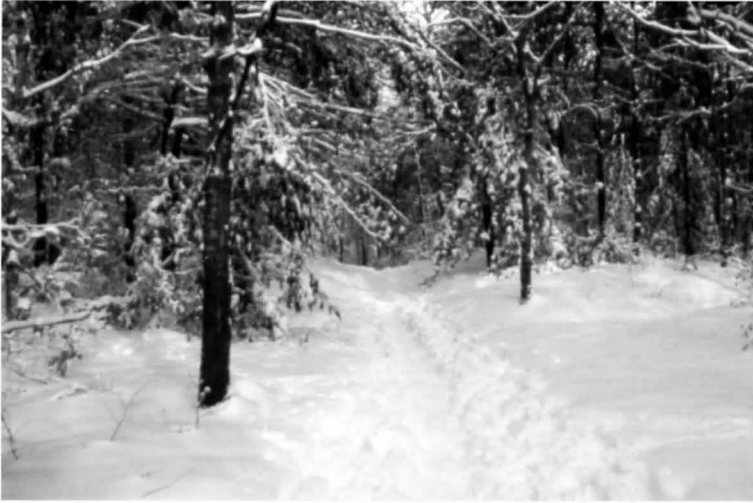
Early morning skiers usually take advantage of new snow on the trails before hikers and dog walkers add their footsteps.

To thousands of second and third generations of summer people, Cape Cod is home. It's not just a place where they can beat the heat or meet the elite or whatever....To many of those brought up on the Cape summer or year-round, those memories plus the rare combination of New England countryside and sparkling seaside are irresistible, in memory and in fact.