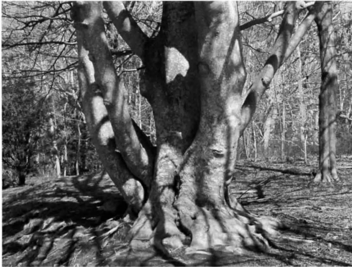
Large multi-trunk beech tree close to Highfield Theater may be a survivor of early wood cutting and fire.

"Upon these hills in the west, up which you were wont to climb in pursuit of wild game, fruits, and the beautiful trailing arbutus, and to gaze upon the delightful prospect spread out before you - the rural village nestling among the green foliage, the waters covered with the white sails of commerce, and the green islands in the distance - upon these hills have been erected almost palatial residences with their beautiful lawns and drives, yet with much of their natural wildness still remaining"