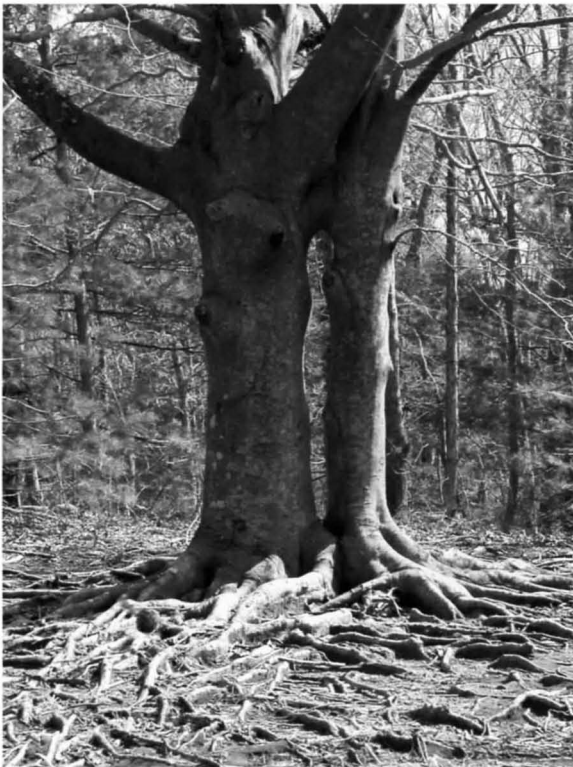
Double-trunk tree on path behind Cape Cod Conservatory.

Before noon on Saturday it was a line of fire marching threateningly upon the theatre, hotels, and outbuildings of Tanglewood on the tree-covered hill above Falmouth village. The far-flung fire jumped the road which bulldozers had widened and cleared in the track of a long overgrown woods road near Elmer Gifford's on Sippewissett Road [corner of Sippewissett Road and North Palmer Avenue,