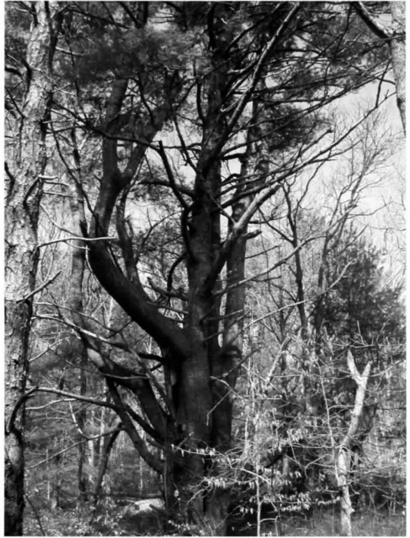
Large pine tree.

Burned areas in the Beebe Woods should be planted over and a scenic drive opened up in Sippewissett. It will pass through beautiful ponds and along the high