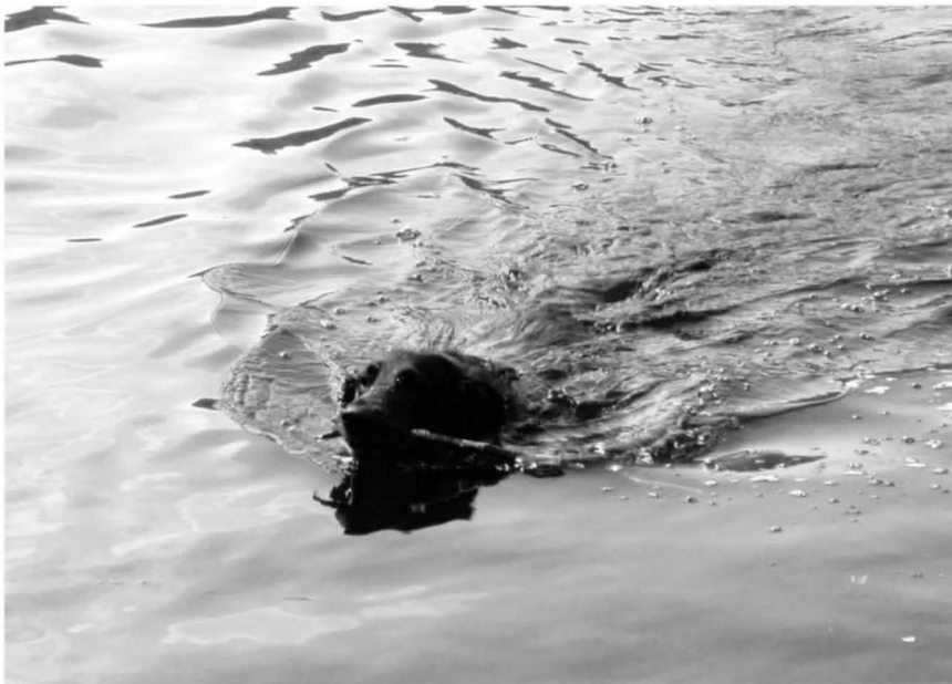
Black dog enjoys retrieving stick again and again.

The Nature of Cape Cod by Beth Schwarzman, published 2002 by University Press of New England.