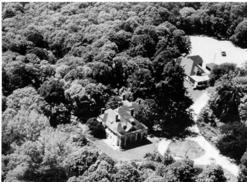
Aerial view of Highfield Hall and Highfield Theater surrounded by Beebe Woods' thick canopy of trees.