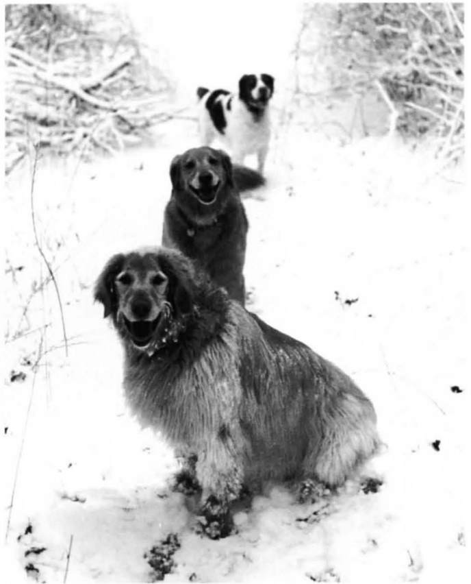
Snow-caked dogs pause, panting from their exertions in the deep snow.