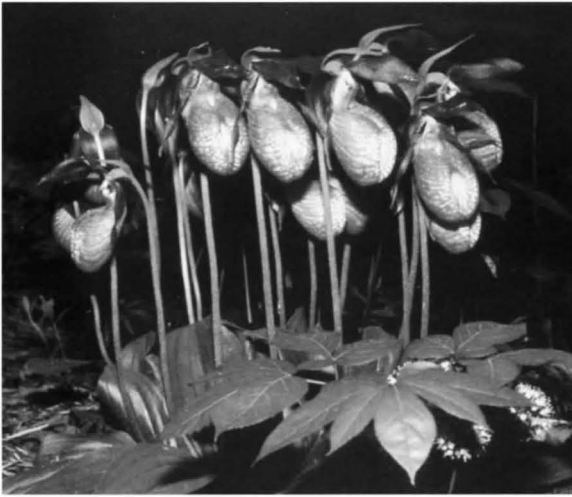
Lady's slippers abound in the spring woods.

Not far from the parking lot there is an old, abandoned apple orchard, and in autumn the trees hang out their tart misshapen fruit while heaps of wild grapes wind about them. At one bend in the road, two large old pine trunks, felled by some forgotten storm, lie together in stranded majesty like huge twin skeletons of beached whales. They have, in fact the color and crumbly texture of old whale bones found on the beach. Their long spires, still intact and lichen-encrusted, point due northwest, recording like frozen weathervanes the fate that rushed in from the southeast to fell them many years ago.