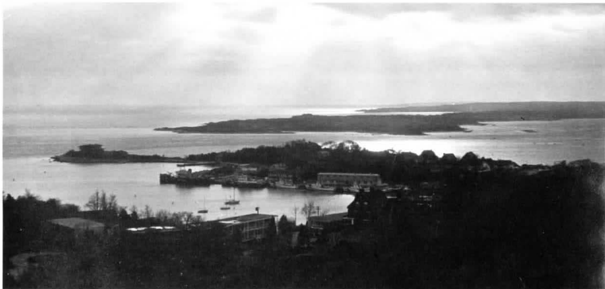
Photograph of Woods Hole Passage and the Elizabeth Islands taken by Salley H. Mavor in 1972.

As I thought about these questions, I tried to discern the thoughts of people on Cape Cod 350 or more years ago when Woods Hole and other curious names entered the historical record. I explored maritime terminology, native American legends and history, colonial records, and even glacial geology. The chances of discovering definite answers are slim, but maybe what is more important is the process of