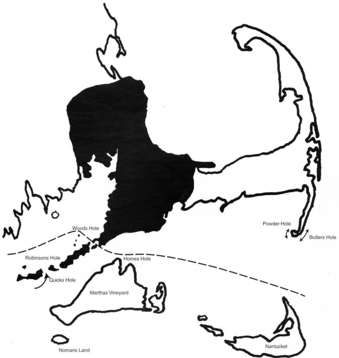
Map of southeastern Massachusetts showing the extent of Wampanoag Manomet in 1654. Black area is Manomet. Dotted line shows boundary between Plymouth Colony and Mayhew's island colony, also claimed by the Duke of York and the Netherlands.