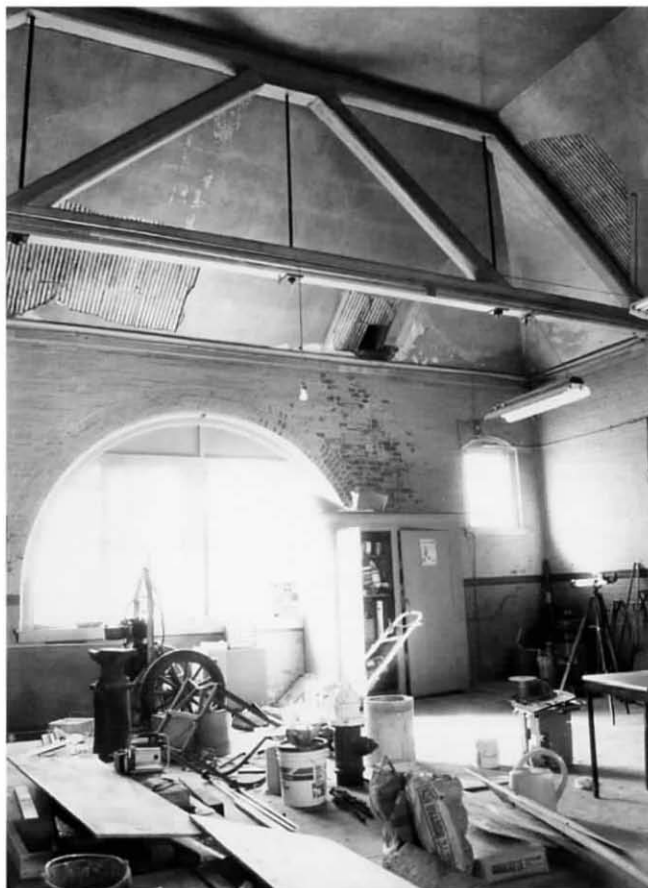
Interior detail of pump room showing queen-post roof truss and arch window. Photo by Matthew A. Kierstead, March 1997.

dows. The rubble foundation contains a single basement window opening with a granite lintel.