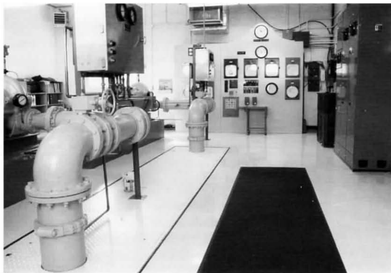
Pump room as it looks today. March 1997.

wood door with a top pane, and a modern screen door. This door leads out to a large poured concrete porch slab. South and east of this last section, and the porch, is a long, four-by-one bay, flat-roofed section with a high rubble foundation, wood shingled walls, and an overhanging slate roof with painted wood soffits, eaves, and brackets. The south and east elevations contain, respectively, four and one, six-over-two, double-hung, wood-sash windows, and the foundation is broken once on each of these elevations for a basement window, now blocked off. The interior of the engineer's dwelling is accessed by the front door at the east end of the front porch, which leads to a small parlor/office with a fireplace and wood trim around the windows and doors. The interior floor plan is unmodified, and includes a kitchen, bathroom, three bedrooms, a pantry, and a linking hallway, most of which have been remodeled for office space.