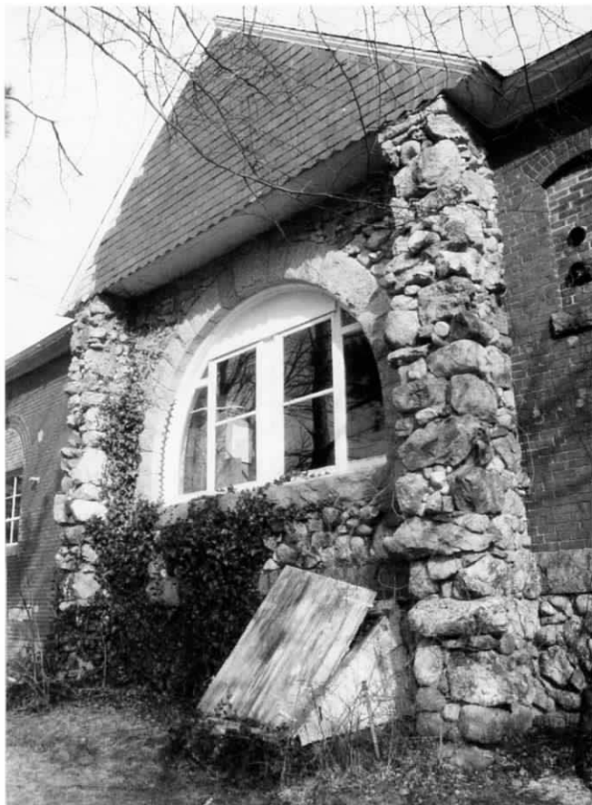
Exterior detail, pump room arched window. Photo by Matthew A. Kierstead, March 1997.

The setting around the two ponds is mostly wooded. Pumping Station Road begins at a small, informal, modern gate on Palmer Street, flanked by two cast iron fountains moved from previous Falmouth locations. A large paved area separates Pumping Station Road from the stock house/garage to the north.