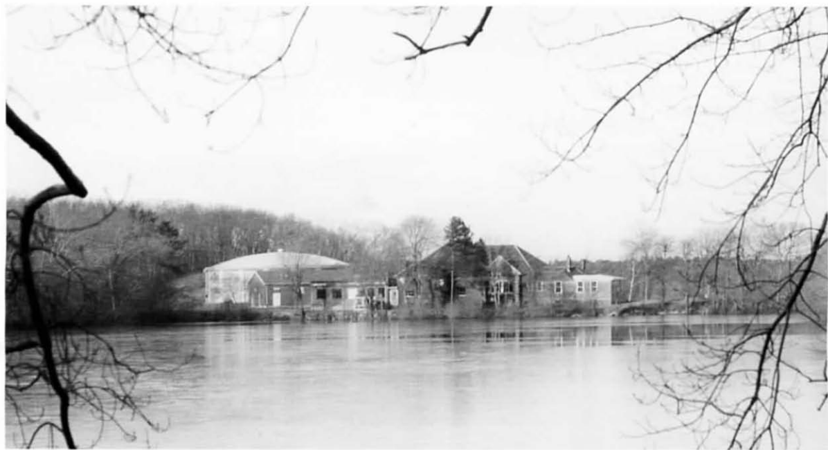
Looking northeast across Grews Pond to Pumping Station with new round chlorination tank on left. Photo by Matthew A. Kierstead, March 1997.

The Falmouth Pumping Station complex, a late 19th century pumping station with early and late 20th century ancillary structures, possesses integrity of location, design, materials, workmanship, and association. The pumping station is significant as an intact, well-detailed example of the waterworks archi-