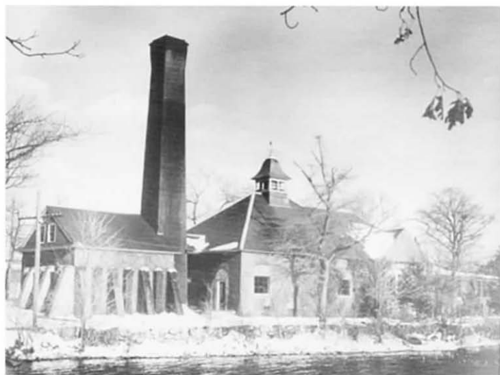
Historic view of Falmouth's 100 year old Pumping Station with its original large brick chimney on the north side.

would also be a major scenic element of Goodwill Park. The organizers of the Falmouth Water Company wanted it to demonstrate the town's good taste and civic pride, just as other municipal buildings of the era did.