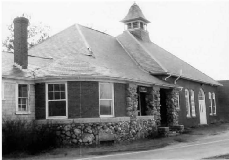
Exterior detail, keeper's house, looking southwest. Photo by Matthew A. Kierstead, March 1997.

and associated chlorination tank. As Falmouth's population has grown, three additional wells, located at Fresh, Coonamessett, and Mares ponds, have been installed to meet the added demand for water. 20 An earlier well installed near Ashumet Pond has been closed indefinitely because a plume of polluted groundwater is moving through that part of the aquifer. The Falmouth pumping station, drawing from