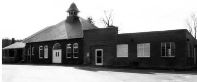
Pumping Station with its modern brick wing added on the north where a large brick chimney once stood. On the south side a brick, stone, and wood shingle extension was built in 1904 to house the engineer and his family.

The first major exterior change to the pumping station building occurred in 1903. The steam engines and pumping equipment required the constant attention and presence of an engineer to oil and check the machinery and fire the boilers. When first constructed, the only space for the Falmouth engineer and his wife was a seven-foot high plank partition which provided a 9-by-27-foot space for sleeping, sitting, cooking, and eating. This space included neither sink nor chimney, and cooking was done on a kerosene stove. In 1903, the Town water commissioners saw that this situation was unreasonable, and obtained plans for the engineer's dwelling from