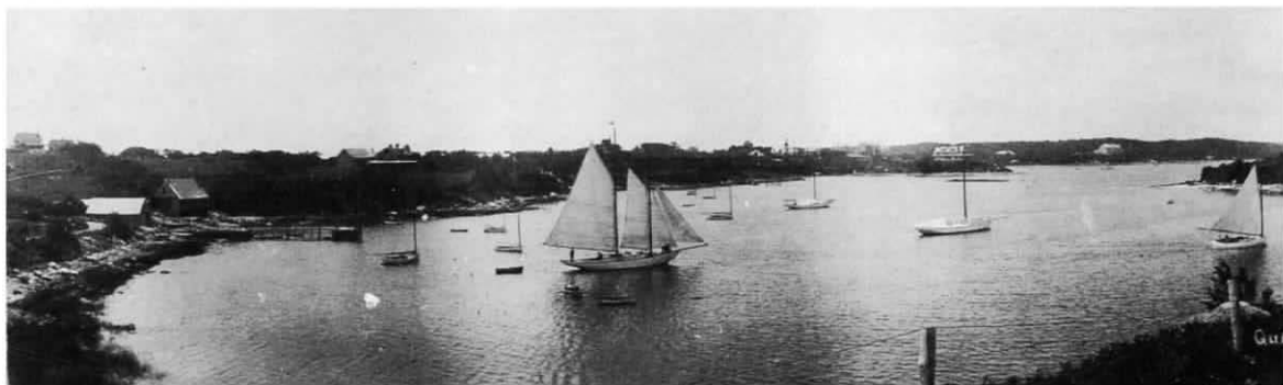
Quissett Harbor, 1907.