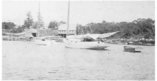
Cat boats and boat house, Quisset Harbor.