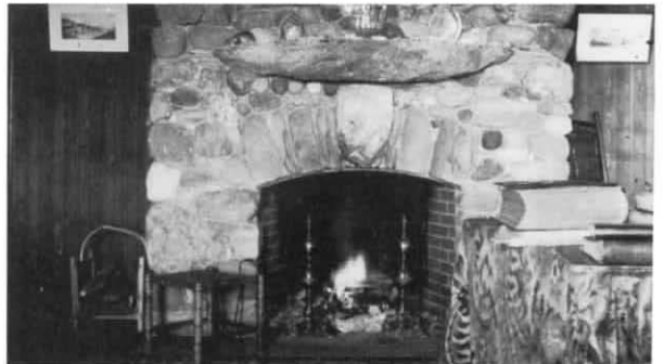
Fireplace, Petrel's Rest.