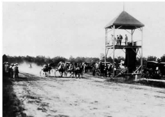
Trotting Park in Teaticket, ca. 1896.