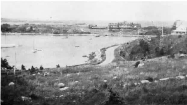
Quisset Harbor from Sunset Hill.