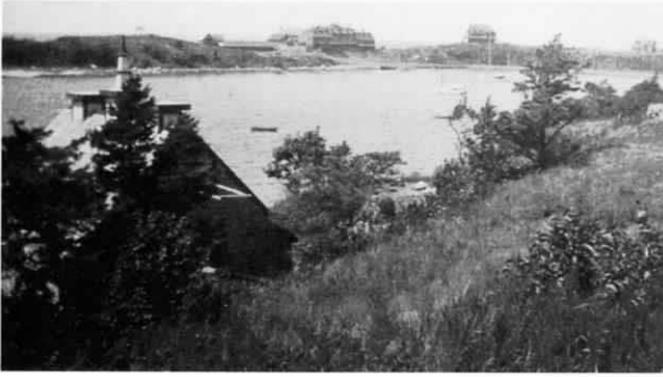
Quisset Harbor from Love Fish's cottage. The Harbor House, Petrel's Rest and Harbor Head Cottage in background.