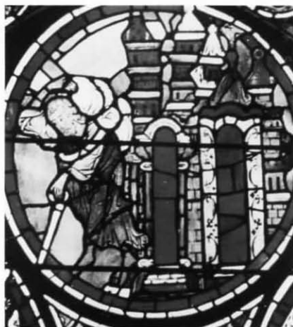
Window from Bourges Cathedral: France, 13th century, Old Testament Scene .

Included in the other two panels are the half figures of the four Evangelists. The young and beardless one