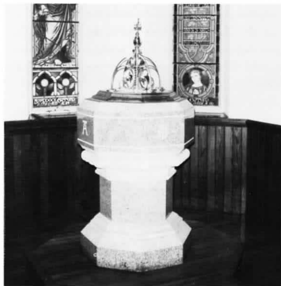
Baptismal font and cover: brass and marble, between 1888 and 1908.

The process of enameling figures like those on the altar cross involves pouring molten glass into separate metal compartments to delineate the shape of each figure. Similar techniques have been known since pre-Christian times, but the enameling of objects is best known through the "champlevé" religious art created in France and Belgium in the eleventh and twelfth centuries.