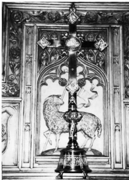
Altar Cross: stone Church of The Messiah, between 1888 and 1908, enamel on brass, early 20th century. Lamb of God and Evangelist Symbols .