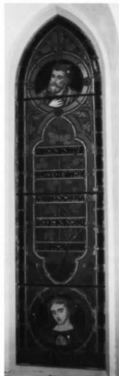
Window from first Church of The Messiah: 1854–1888, Evangelists.

In the stone Church of The Messiah, the window over the altar is the most prominent window, especially when its array of colors is illumined by a morning sun. A majority of other nineteenth century windows created for the area over the altar followed the tradition of a Gothic Revival pointed arch. But here we see a transition from the nineteenth to the twentieth century.