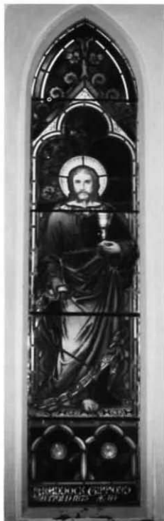
Window from first Church of The Messiah: 1854–1888, Christ.

Although nineteenth century artisans could not fully recapture the quality and inspiration of their medieval predecessors, the trio of windows from the first Church of The Messiah would have been more brilliant in their original setting over the altar.