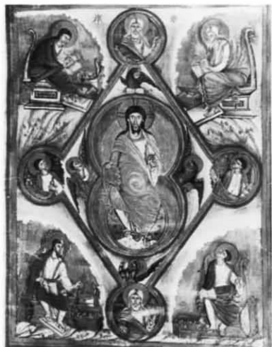
Manuscript: The Vivian Bible in Bibliothèque Nationale, Paris, 9th century, Christ with Four Evangelists .

The figure in the central panel of this trio is somewhat larger than those in the two side panels, and is immediately identifiable as Christ through centuries-old iconographic conventions. His nimbus is crossed, He is bearded, His long garments are red and blue, and He carries a chalice and small loaf of bread, symbols of the Eucharist. He is placed within a tri-lobed