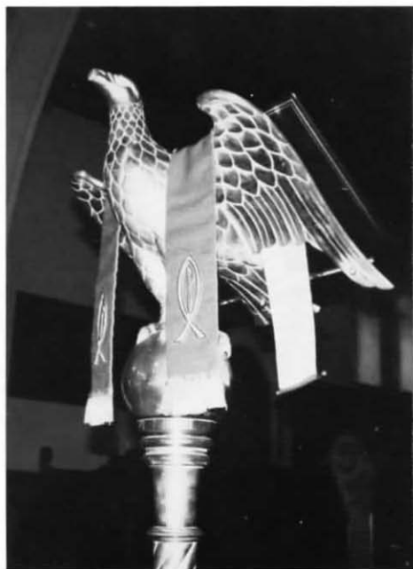
Eagle on lectern, early 20th century.