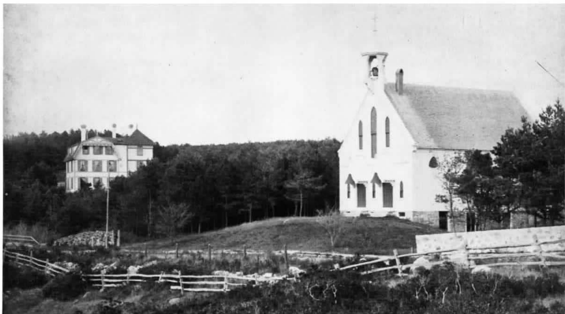
First Church of The Messiah, ca. 1882. Rectory on the left, 1877; stone wall on right, 1882.

The artist or the atelier which created these three surviving panels from the first church is unknown, but