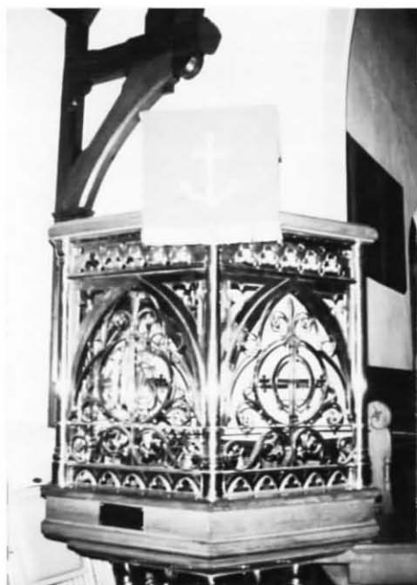
Pulpit, brass, between 1888 and 1908.

For centuries, church brasses have enhanced the aesthetic appeal of the service. The bell in the Church of The Messiah dates from the original 1854 church and has been in the stone church since its construction in 1888. The other brasses in the church are the lectern,