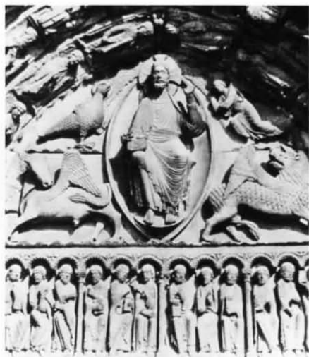
Sculpture: 11th-12th century. Main W. Portal of Chartres Cathedral, France, Christ with Four Evangelists Symbols .