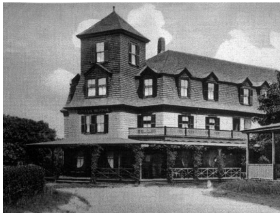
The Craig House offered picturesque views of Nantucket Sound and exceptional accommodations from 1880 to 1978.

These patrons were offered boating, bathing, steamship excursions, long distance telephone service, orchestral entertainment, and exceptional meals in a dining room that could accommodate 100 people. As the owners noted,