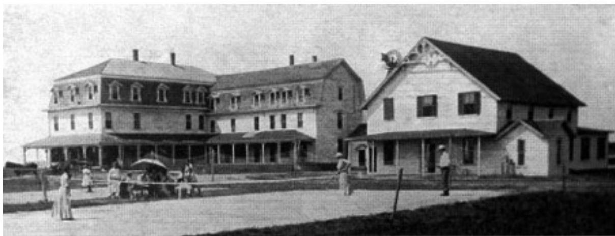
The Menauhant Hotel in East Falmouth provided visiting families with an assortment of oceanside activities.

The hotel was a true family resort, accommodating 150 guests with panoramic views of Bournes Pond, Eel Pond, and Nantucket Sound. There were tennis courts, a baseball field, and a stable for horseback riding on the property as well as an amusement building where guests could play billiards and shuffleboard, bowl, and dance to an orchestra on Saturday evenings. The guests also had use of the telegraph, telephones, and the on-site post office with two mails a day each way.