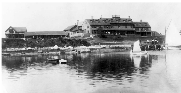
Along Buzzards Bay, the Quissett Harbor House offered a less formal summer experience for its guests.