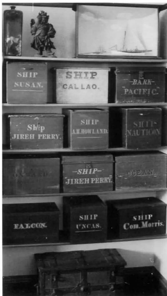
In the Counting House at the New Bedford Whaling Museum are wooden boxes which once held ships' papers. On the lowest shelf are two which belonged to Uncas and Commodore Morris , Swift family whaleships built in Woods Hole in 1828 and 1841.

the case of the ships mentioned, the Swifts were the managing partners.